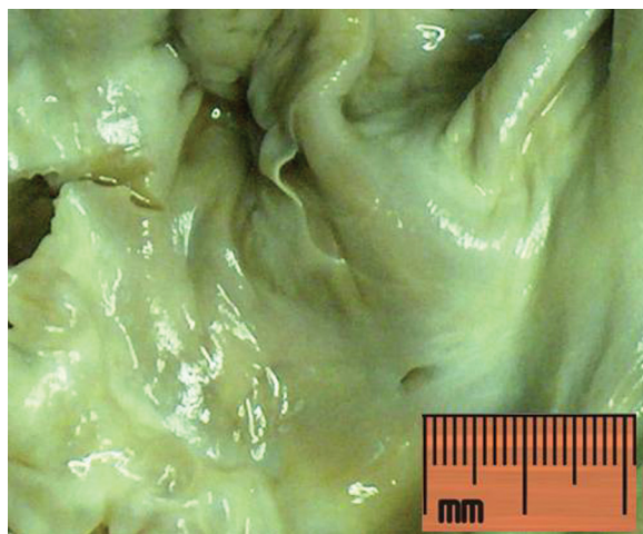
Figure 4. Thebesian valve covering more than 75% of the coronary sinus ostium.

CS during atrial systole. Relatively small number of studies describes echocardiography imaging of the normal TV. Presumably due to its thin nature and small size it is usually visualised occasionally [1, 2, 8].