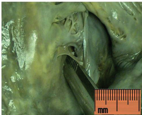
Figure 1. Fenestrated Thebesian valve.