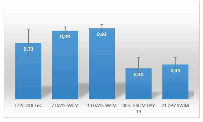
Figure 2. The comparison of Adrenaline serum among groups

dard deviations (SD), on the basis of which satisfactory susceptibility can be ascertained. Based on the values of the standard deviations (SD) and its ratio with arithmetic mean (Mean), it can be concluded that at all time points there is no statistically significant deviation of the results from the arithmetic mean. The numerical values of the standard error indicate a minimum dispersion, because, with proportional looking, there are not significant in relation to the corresponding value of the standard deviation. The results of Kolmogorov Smirnov's procedure showed that, at all time points of collection, the results are normally distributed (Table 2). In order to determine in which of the examined groups there are statistically significant differences, the post hock (LSD-least significant difference test) tests are applied. The analysis of the tests is shown in Figure 3 and Table 3. From the overview of arithmetic means and the level of statistical significance, it can be seen that the control group shows lower values of adrenaline in the serum relative to the group