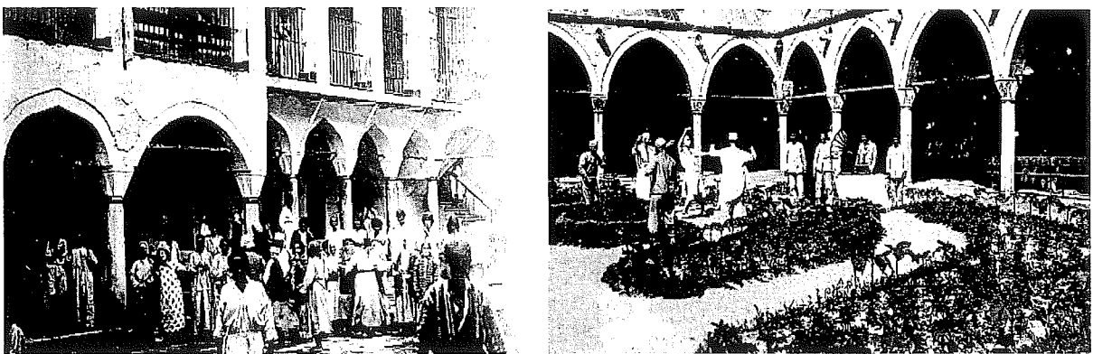
Picture 2. Toptaşı Bimahane (1873-1927)