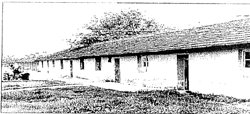
Picture 1. The old building where the Institution began with work

In 1962, the Executive Council of Republic of Macedonia made a decision which deviates part of the "Institution for hard psychologically disabled children"- Demir Kapija, where as a part of the Institution, the facility for "severe retarded and mild imbecile children or moderate retarded children"- in Drachevo (Picture 1). Thus in 1963, the adaptation of premises in the Institution has begun in the Dracevo village, in order to be used for rehabilitation of children with mild intellectual disability.