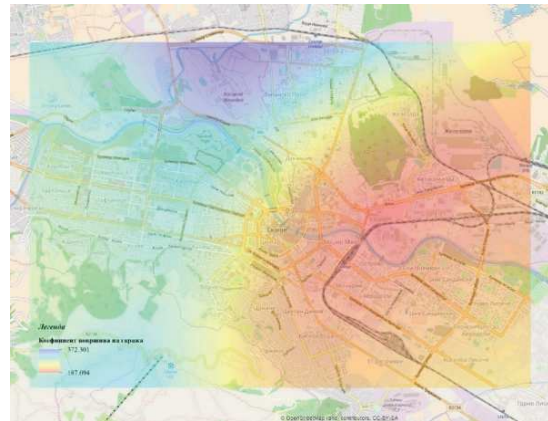
Figure 3. Values of the coefficient in front of the variable area of the garage

The analysis of the raster data model of the coefficient for the impact of the garage surface showed that this impact is greater in the municipalities of Centar and Karposh, while in the municipalities of Aerodrom and Chair, that impact is less, as expected, due to the existence of more and larger parking spaces.