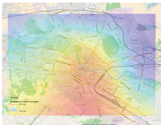
Figure 2. Value of the coefficient before the variable age

spatial variations within the research area, which can help in effective decision making. Such records can provide an excellent insight into the key parameters that affect the value of the property in a particular area. For example, the age of the property can have a significant negative impact on the value of the property in newly developed areas where most of the properties are completely new, and on the other hand it can have a positive impact in an old part of the city where older buildings have architectural features and historical significance. In order to emphasize the importance of these models, the results of the age factor of the building will be presented. As expected, the age of the building is inversely proportional to the value of the property, i.e., the older construction reduces the value of the property due to obsolescence, deterioration and depreciation. The analysis of the raster data model of the coefficient for the age of the building showed that the impact of this factor varies through the field of research and less impact (lower coefficients) this factor is observed in the central area of the city, while the impact of the age of the building increases as we move away from the central urban area, to the settlements of Karposh, Aerodrom, where new buildings are being built and the demand for new buildings is higher.