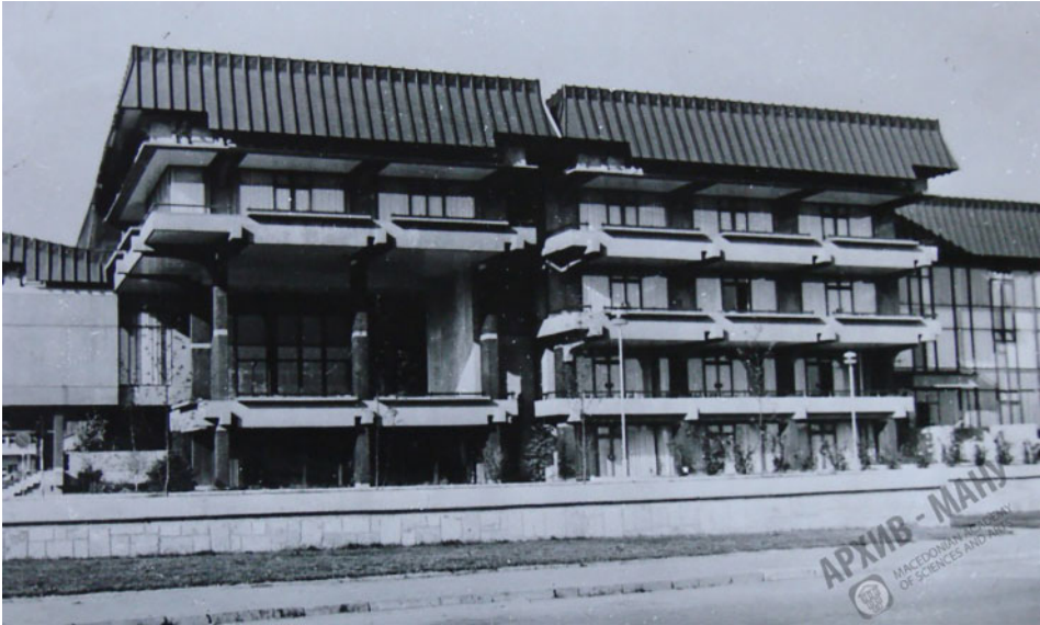
Figure 3: Building of the Macedonian Academy of Sciences and Arts (MANU)

and art. I think of a fortress and it seems too cold to me. The colorful decoration of the Byzantine church would be demagogy. I reject all concretized analogies and surrender to the urge that has already accumulated many encounters with historical architecture. And when the work is finished, I discover that in the monastery quarters of St. Jovan Bigorski, the old Macedonian master created an impressive monumentality in chestnut wood. I see the 'porch neither in the sky nor on the ground' from the folk tales, and in the interior, instead of the cold emptiness of the feudal palace, the warm intimacy of the patriarchal Macedonian home has been created." The result is a building in which he materialized his long-standing commitment to contemporary architecture that skillfully reads and interprets traditional heritage. For the MANU building, Chipan received the highest Yugoslav award for architecture from the NIP "Borba" in 1977.