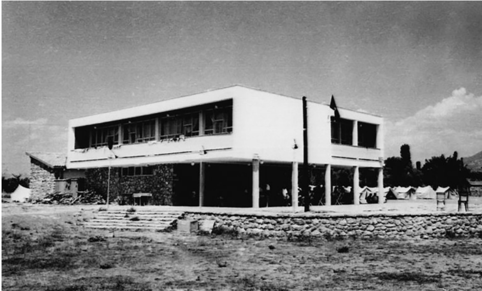
Figure 1: Student ferial resort

based on the development of republic tourism by the economic policies of self-managed socialism that encouraged state investments in tourist infrastructure and a wide network of workers' resorts at affordable prices. The building represents one of the earliest examples of modernist architectural creation in the Ohrid region, strongly influenced by the international style and in many elements reminiscent of the iconic architectural figure of Le Corbusier's Villa Savoy. The building establishes a relationship with the surrounding nature and the picturesque natural landscape, ensuring integration of the interior and exterior spaces.