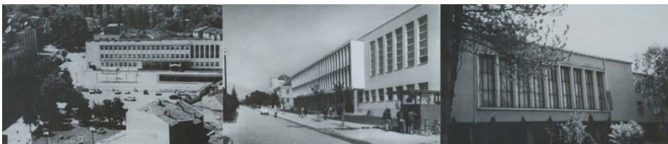
Figure 2: Court buildings in Veles, Bitola and Shtip

His other more notable buildings are the administrative building of the Social Insurance Institute in Ohrid (1955), the court buildings in Veles (1956), Bitola (1958) and Shtip (1960) and the building of the Faculty of Technology in Skopje (1965). As public buildings were mostly ordered by the state, Chipan's work in these buildings reflects the ideological discourse in Yugoslavia and achieves continuity with the architectural expression of high Modernism. The compositions are dominated by regular geometric shapes and facade openings whose rhythm further reinforces the principle of order and impression of discipline. In all the court buildings this pattern is further emphasized by vertically placed concrete ribs acting as brise-soleil, as a kind of abstract, contemporary ornament.