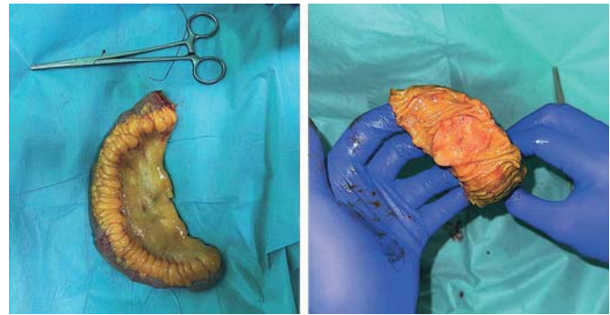
Figure 3. Resected segment of ileum with associated mesentery showing intraluminal mucinous adenocarcinoma.

fluids and two units of packed red blood cells, raising the hemoglobin to 80 g/L. Elective midline laparotomy identified a 3-cm neoplastic lesion 25–30 cm proximal to the ileocecal valve, extending into the mesenteric tissue, with no distant metastases (Figure 2). Segmental small bowel resection with 10 cm proximal and distal margins, including mesenteric fat, was performed. Gastrointestinal continuity was restored via a termino-terminal ileo-ileal anastomosis (Figure 3). Gross pathology showed a 2.7-cm ulcerated gray-whitish mucinous tumor involving ~70% of the luminal circumference, located 10 cm from the proximal margin. Microscopic analysis shows a mucinous adenocarcinoma with mucin production up to 60% of the tumor population. The tumor shows an infil-