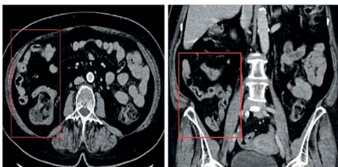
Figure 1. Axial and coronal CT images of the ileocecal region show no visible pathological mass.

A 74-year-old woman presented with intestinal bleeding and symptomatic secondary anemia, accompanied by intermittent dull right infraumbilical pain. Anemia symptoms, including pallor, dizziness, generalized weakness, and fatigue, had begun 2–3 months prior. Physical examination revealed a soft, non-tender abdomen; no masses were palpable. Digital rectal examination was unremarkable. Laboratory evaluation showed hemoglobin of 71 g/L and an erythrocyte count of 3.40 \times 10^{12}/L . Abdominal ultrasound and contrast-enhanced CT of the abdomen and pelvis revealed no mass, lymphadenopathy, or metastasis (Figure 1). The patient received intravenous