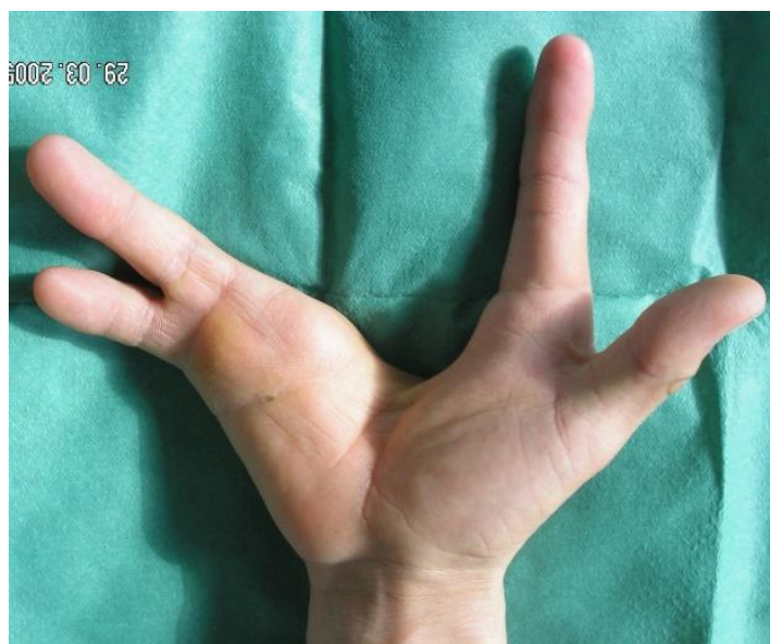
Fig. 2. Right hand with central wide cleft, absent middle finger, normal first web and incomplete syndactyly of IV-V finger