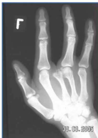
Fig. 4. X- ray of left hand

In preparation for surgical treatment, we had to find the most suitable surgical procedure for this type of cleft hand, considering the age of the patient and the desired cosmetic appearance of the hand. According to the Sandzén classification, this cleft hand can be classified as type II. Type II reconstructive procedures should provide as effective a pinch and grasp as possible between the radial and ulnar columns by deepening the central cleft, excising "digital nubbins" and any impinging skeleton, and performing rotational osteotomies of either metacarpal base or both and, occasionally, transfer to provide active digital flexion [10] . We classified this patient as Manske and Halikis type I - normal first web, and they propose no surgical intervention for this type of cleft hand 5 . Using the DAST concept, we classified this patient as D1 (one missing digit), A0 (no associated anomalies), S1 (site of the cleft- central) and T0 (functional status of the thumb - normal) [11] . When there is wide central cleft with normal thumb and index finger, the author's recommended procedure is the Barsky technique of creating a commissure [11] .