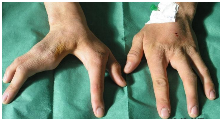
Fig. 1. Bilateral cleft hand