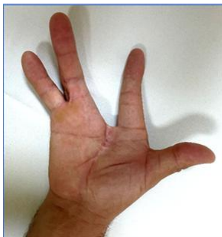
Fig. 5. Right hand at 15 year follow-up

postoperatively, but the functional result was still satisfactory. The cosmetic appearance of the hand improved substantially, much to the patient's satisfaction (Figure 5). At 15-year follow-up, the final result was very satisfactory - with preserved range of motion, preserved postoperative appearance of the hand and no complaints from the patient (Figure 8). He got married 5 years after surgery and he is a father of one son who is healthy with no congenital anomalies.