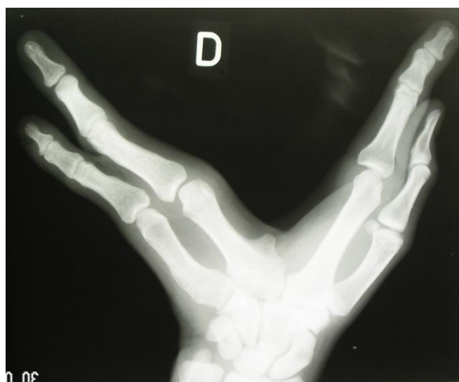
Fig. 3. X- ray of right hand