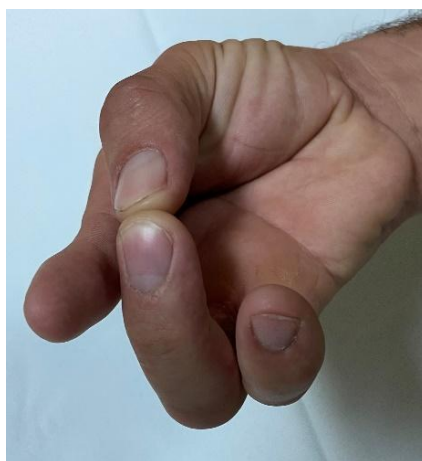
Fig. 7. Right hand - Postoperative functional result