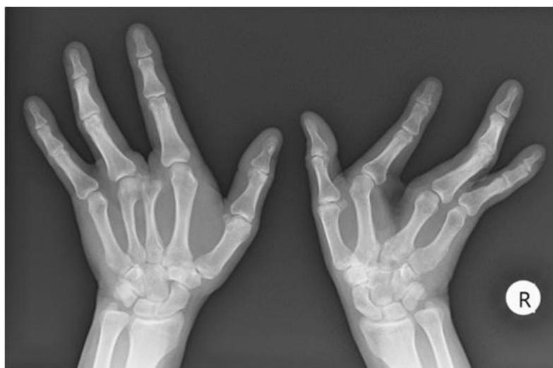
Fig. 8. At 15-year follow-up, X- ray - both hands