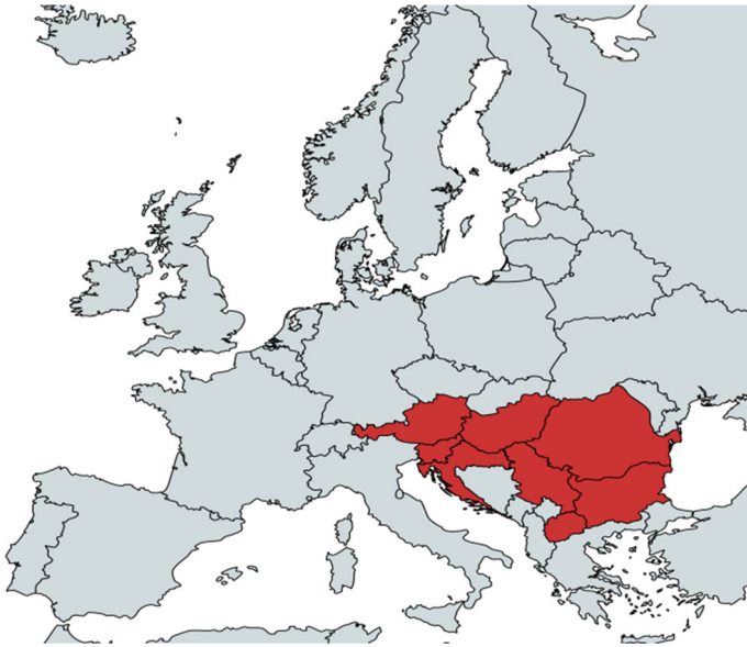
Fig. 1 Countries included in the review

socialism, (b) historical influence of the same “veterinary schools”, (c) language similarities (German and Slavic base with the exception of Hungary and Romania), (d) cultural heritage, and (e) continuous human migration across the region. Because of the similarities, research conducted in the countries observed should be applicable to the wider Danube region.