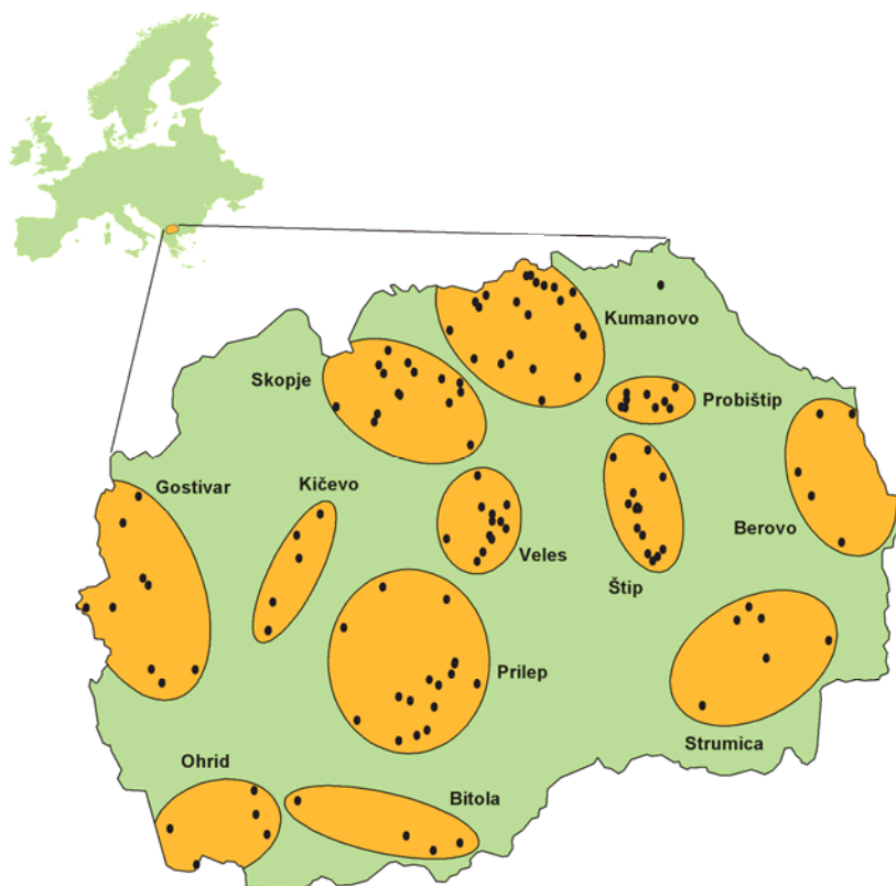
Fig. 1. Sketch map of researched areas with sampling locations

Approximately 0.5 g of honey was placed into PTFE vessels and 2 ml of concentrated HNO 3 and 2 ml of H 2 O 2 (30%, m/V ) were added. The vessels were capped closed, tightened and placed in the rotor of microwave oven and digested with the two step procedure given in Tab. 2. Ventilation was performed for 20 minutes after the end of the second step. Finally the vessels were cooled, carefully opened and quantitatively transferred in 50 ml calibrated flasks.