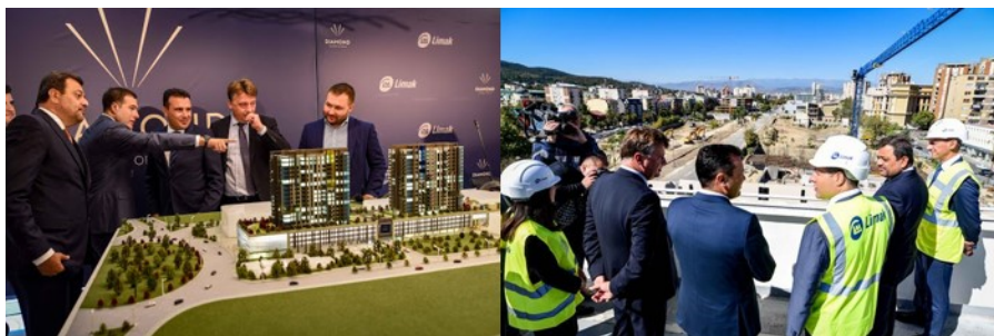
Figure 1. Presentation the project Diamond of the company Limak, before the prime minister, the minister of economy, the mayors of Skopje and the municipality Centar Skopje. [12]

Looking at the developments in the cities around the world, more specifically in the city of Skopje, the conflict between “investor urbanism” and the more and more louder civil actions for preservation and provision of new public spaces is becoming evident. Globally, the struggle takes place under the motto “Right to the City”, inspired by the works of Lefebvre [10], as well as inspired by the struggle and the work of Jane Jacobs, mostly by her book The Death and Life of Great American Cities [11]. The louder and more massive protests of citizens are driven by the growing awareness that the city is rapidly losing its free space, and that the citizens are denied the opportunities for a quality life which is mean just living and working, where everyone is locked in his home or office. Buildings are popping up at every turn, and street corridors are being winded to only to cater to the needs of the cars.