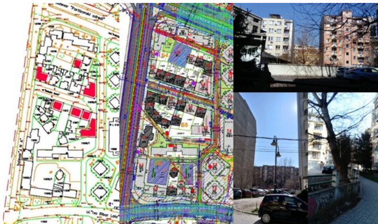
Figure 3. Urban quarter City Wall-West, insertion of new construction site on existing children's playgrounds and local parking lots

Additionally, the denationalization of land further contributes to the reduction of public spaces, where owners of plots located on those locations appear. The local government does not see the consequences of returning those properties and does not even try to find other solutions.