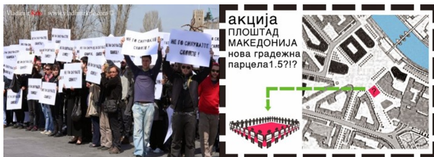
Figure 2. First Archi Brigade (2009) - Protest of the architecture students as a reaction to the planned construction of a building on the square Macedonia [13]