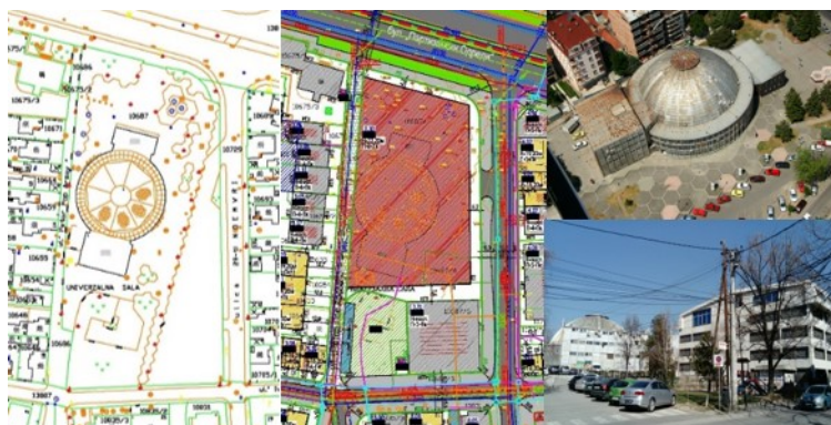
Figure 4. Urban quarter Bunjakovec, Universal hall – Part of the site occupied by new Multi-story Car Parks

In the yards of public facilities, often new surfaces for buildings are inserted due to the same reasons listed above, for "easy surrender" of the land owned by the country or the municipality and the need to full in the budget. Investors, again, see their interest in cheaper land, but also in "easier bargaining" with the state/municipality. Namely, the government and the municipalities actively promote the sale of land under facilitated conditions, etc. "attracting investments".