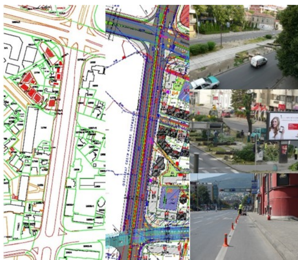
Figure 5. Boulevard St. Clement of Ohrid - From a beautiful boulevard to an asphalt canal

With respect to the street network, there is a tendency for narrowing the corridors or at least to use it for broadening of the roadway. New buildings are placed directly on the front property line, in the street profile, sidewalks are built with minimum dimensions (1,5 m). Planners see no reason to protect the corridors where they are wide, nor to widen them to provide quality open spaces - sidewalks with a passing width for more people, with tree lines, urban equipment, green belts, bike paths. On the contrary, there is a tendency to narrow the pedestrian space and the space in front of buildings, at the expense of increasing the areas for construction of new buildings. The advantage given to cars also leads to the loss of former wide boulevards with wide median strips. The most drastic example is the destruction of the most beautiful city boulevard in Skopje, boulevard St. Clement of Ohrid. The water canals from Vodno are treated as non-existent and technically surmountable, so their passage through the city is regulated underground. These canals, an important urban element the arrangement of which can contribute, in addition to safety and aesthetic quality, as green-blue corridors.