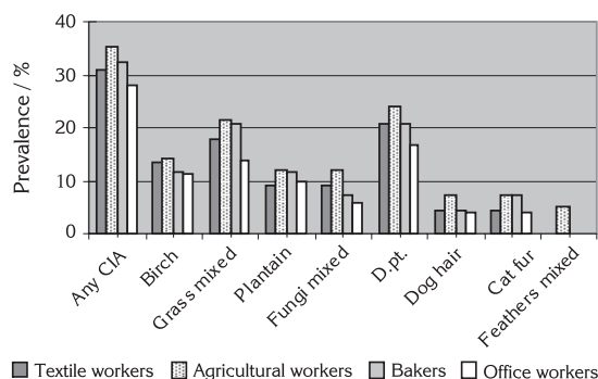
Figure 2 Prevalence of sensitisation to CIA in textile and agricultural workers, bakers, and office workers. CIA: common inhalant allergen; D. pt.: Dermatophagoides pteronyssinus

EIB prevalence is expressed as the percentage and the number of subjects affected; mean fall index FEV 1 as means with standard deviations. EIB: exercise-induced bronchoconstriction; FEV 1 : forced expiratory volume in one second; ECT: exercise challenge test.