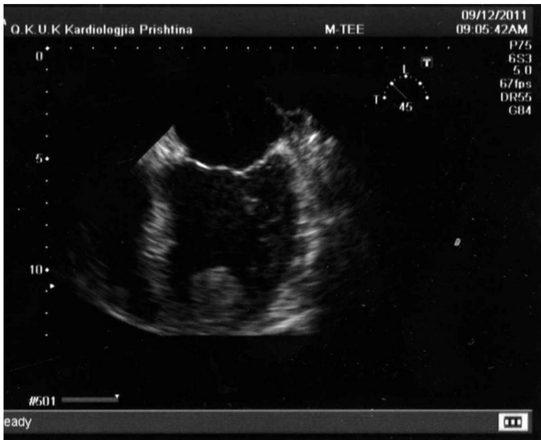
Fig. 1. Transesophageal echocardiography image showing a 6.8cm 2 protruding and ball-like thrombus in LV apex

*Data are presented as mean ± SD. IVSd: diastolic interventricular septum; PWd: diastolic posterior wall; LVEDD: left ventricular end diastolic diameter; LVESD: left ventricular end systolic diameter; LV: left ventricular; EF: ejection fraction; LA: left atrium; MR: mitral regurgitation