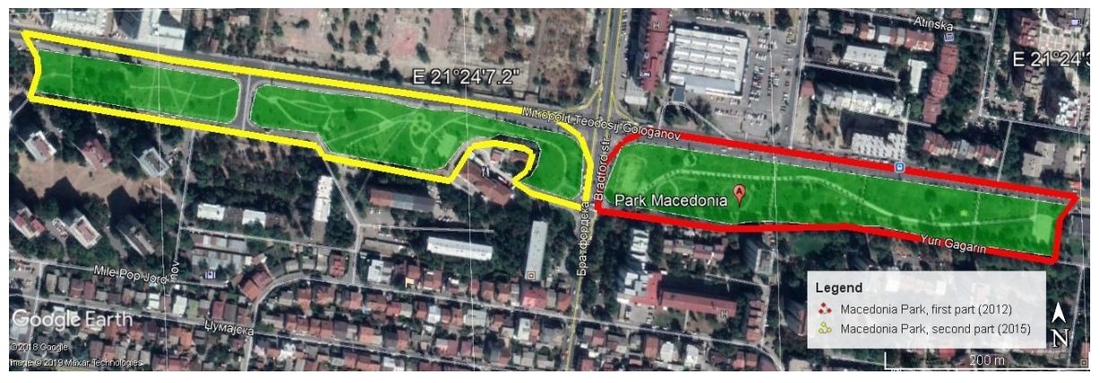
Figure 3. Orthophoto imagery of the Macedonia Park investigation area (Google Earth Pro, 2019)<sup>5</sup>. Slika 3. Ortofoto snimka istraživanog područja parka "Makedonija" (Google Earth Pro, 2019)<sup>5</sup>.

Mitropolit Teodosij Gologanov Blvd. borders the whole Park on the north side. The first part of the Park is bordered partly by restaurants and the 100 Trees Park on the east side, Jurij Gagarin Str. on the south side (Figure 5), and Bradfordska Str. on the west side as borderline with the second part of the Park. In continuation to the west, the second part of the Park is bordered in the south by restaurant and individual housing, objects for collective housing and Jurij Gagarin / Mile Popjordanov Str., and westerly by individual houses.