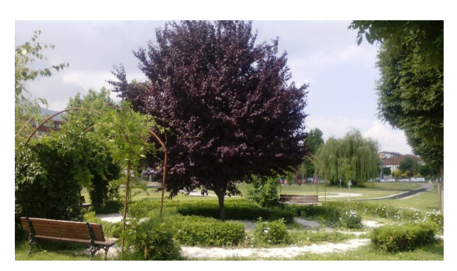
Figure 7. Square with Wisteria sinensis and Parthenocissus quinquefolia on pergolas, border hedges of Thuja occidentalis 'Globosa', and Prunus cerasifera 'Nigra' as focal point, 2018.

Likewise, 87 individuals (6.60 %) of 10 species (12.19 %) occur as line trees (Figure 5), solitary trees or in small groups as remnants of the greening in the past: Platanus × hispanica with 45 trees, Morus alba L. with 13 (Figure 4), Juglans regia L. (with 8), Celtis australis L. (3), Aesculus hippocastanum L. (1), Gleditsia triacanthos L. (1), Pinus nigra J.F.Arnold (1), and Ulmus minor Mill. (1), including 3 species used as a green core of a small sacral architecture: Cupressus sempervirens var. horizontalis (Mill.) Loudon (with 10 trees), Platycladus orientalis (L.) Franco (3), and Pinus nigra (1). It is interesting to note that the citizens of the immediate surroundings planted the white mulberry 'grove' near the wooden gazebo for chess play (Figure 4).