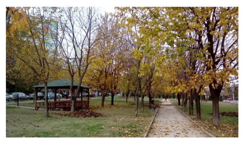
Figure 4. Allée with Morus alba and wooden gazebo for leisure and chess play, 2019. Slika 4. Aleja s Morus alba i drveni gazebo za odmor i igranje šaha, 2019 g.

The mean annual air temperature in the Skopje Valley is 12.4 °C, with a very pronounced annual flow of the air temperature ranging from 0.0 °C in January to 23.6 °C in July. The mean maximum air temperature is between 4.2 °C in the coldest month - January, and 30.6 °C in the warmest month - August. Specific is the variation of the temperature regime and rapid changes in the air temperature in a short period. Summer months have high temperatures - the average monthly temperatures are 20.7 °C in July and 20.2 °C in August. The absolute annual maximum temperature is very high, reaching up to 40.6 °C and the differences with the absolute annual minimum temperature of -25.7 °C are very high. Important for the selection of plants is the occurrence of spring and autumn frosts. The average spring frost date in Skopje occurs between 8<sup>th</sup> and 13<sup>th</sup> April. The average date of the first autumn frost occurs between 22<sup>nd</sup> and 26<sup>th</sup> October. The average length of the ice period is between 165 and 173 days.