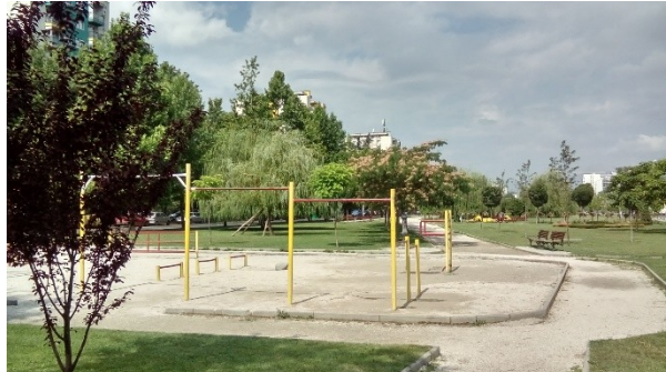
Figure 2. View of the Macedonia Park, 2018. Slika 2. Pogled na park "Makedonija", 2018 g.