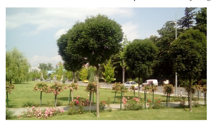
Figure 6. Fraxinus excelsior 'Globosa' with mini and tree roses of the Floribunda Group, 2018. Slika 6. Fraxinus excelsior 'Globosa' s patuljastim i ružama stablašicama hibridne grupe "Floribunda", 2018 g.