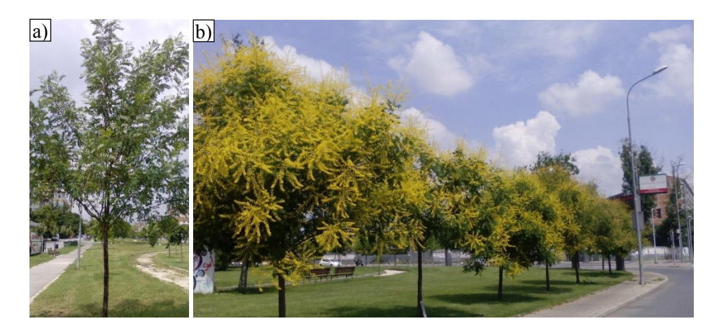
Figure 11. Individual of a) Robinia pseudoacacia and lined trees of b) Koelreuteria paniculata , 2018. Slika 11. Pojedinačno stablo a) Robinia pseudoacacia i drvored s b) Koelreuteria paniculata, 2018 g.

Eventually, it can be noted that only a small portion of the existing dendroflora in the investigated area, probably due to planting time, inadequate microclimate or quality of plant material, physiological weaken, and some species (may) decline. Thus, not only does the specimens lose its decorative value, but also it is necessary to constantly allocate resources for their proper care and maintenance (e.g. the Chusan palms lined trees of the past urban dendroflora) or to replace them again with the same species. Therefore, significant attention should be paid to the (future) proper selection of plants with suitable morphoecological characteristics with seasonal dynamics, and on adequate micro-locations (Simovski, 2011a,b,c,d).