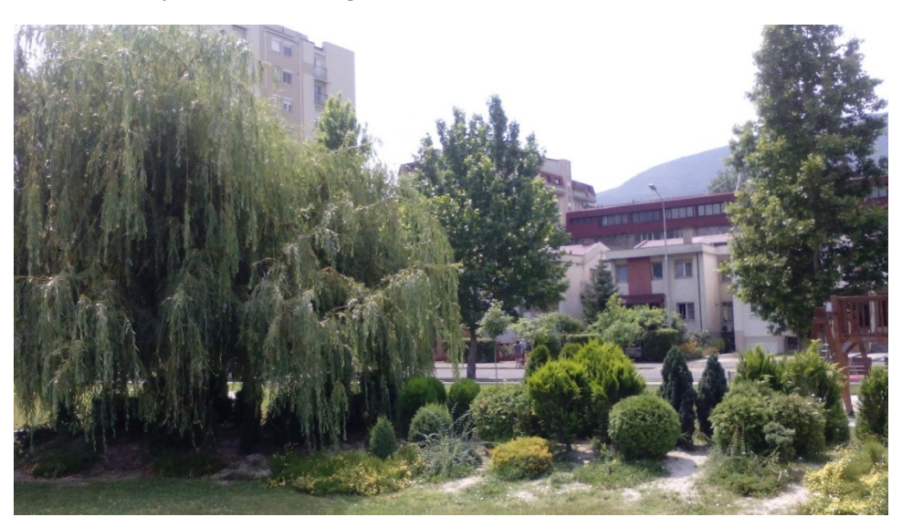
Figure 9. Small alpine-like garden, 2018. Slika 9. Mali (alpski) vrt, 2018 g.

Regarding the ecology of the recent species in the Park, for Betula pendula Roth species it is especially important to pay attention to the humidity, as the silver birch is sensitive to high temperatures and dry air (Džekov, 1988). This is very important for proper growth and development, and even for the survival of these trees, as birch is a light- and humidity-demanding species and thrives on full sun (Džekov, 1988). Several trees, during the data processing, were already withering (Figure 8, a). In addition, withering has been observed in some exemplars of ash, 'Jaspidea' in particular (Figure 8, b), and Thuja spp. (Figure 8, d).