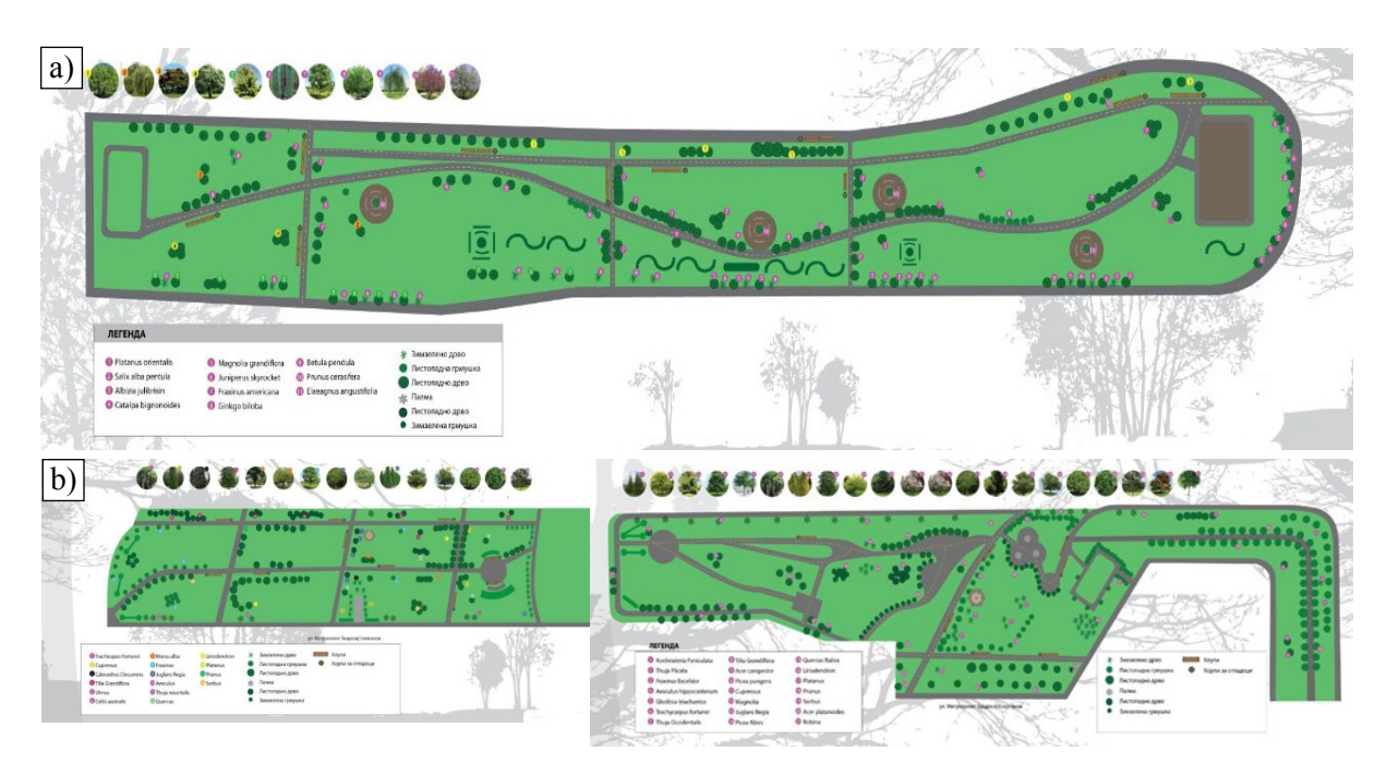
Figure 1. Landscape plan of the Macedonia Park designed by PE Parks and Greenery. Slika 1. Krajobrazno planiranje parka "Makedonija", dizajn JP "Parkovi i zelenilo".

The Macedonia Park is established in the municipality of Karposh in the Macedonian capital city of Skopje. This starts back in 2012 when first microlocation of the Park is designed (Figures 1,a and 2). To be more precise, the Park as a whole consists of three microlocations (parts). The first and the second part are territorial continuum divided by street (Figure 3), but the third microlocation is completely physically apart, and therefore it is not investigated.