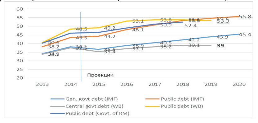
Graph 4. Projections on the future dynamic of Macedonia's debt (% of the GDP)

The Government of the Republic of Macedonia (2015) predicts the public debt in 2018 to reach 52.4% of GDP, while state debt 41.5%, which is similar to the basic scenario in Tashevska's projections (2015)<sup>10</sup>. The projected fiscal trend mainly comes from the high primary deficit, and is partially neutralized by the favorable perspectives of growth. The total public debt will increase rapidly, primarily due to higher spending by state companies.<sup>11</sup> A weaker GDP growth will negatively impact the share of debt through the lower denominator (nominal GDP) and with the worsening of the budget balance as a result of the automatic stabilizers which can cause for the debt to endanger the threshold of 60% of GDP. The same can occur if there is no success in the implementation of fiscal consolidation, while the primary balance maintains a level of around -3%, or if all investment projects are implemented, without changes to the pension policy. It can be concluded that all debt projections point to a growing trend and caution in further public finance management. (Doemeland et al., 2015; IMF, 2015; Tashevska, 2015)