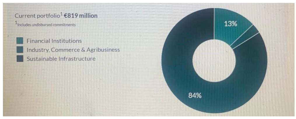
Chart 5 – Sectors portfolio investments in the Republic of North Macedonia as at December 31, 2021.