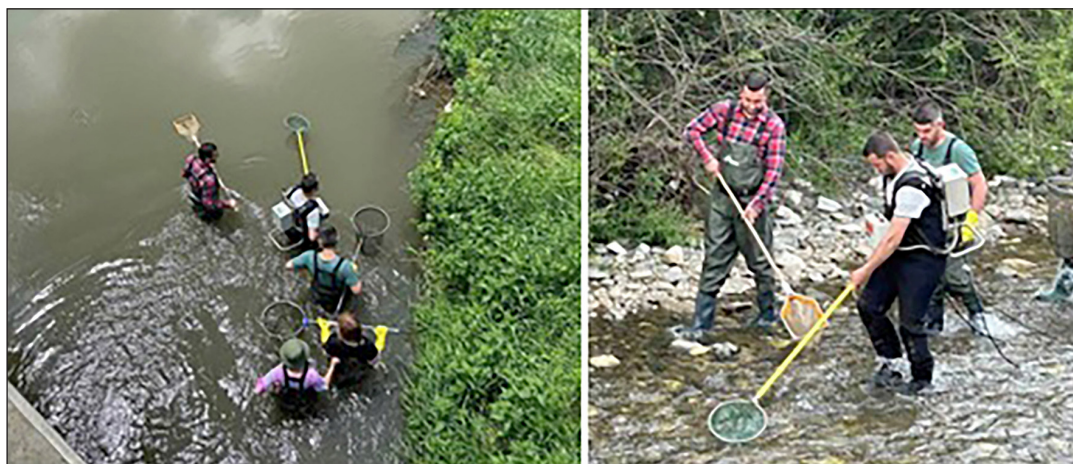
Figure 2. Fieldwork activities in the Lepenc River Basin, Kosovo