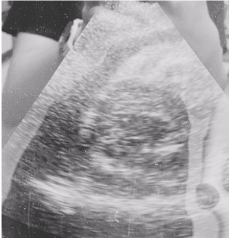
Figure 1. Pericardial effusion without impairment of ventricular filling.