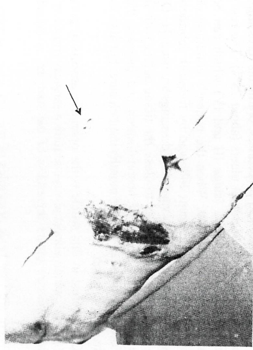
Figure 1 – A forty-six year old female, comatose due to brain injury, developed multiplex back pressure ulcers. The major ulcer in the sacral region is staged as grade IV (sacral bone obvious in the bottom of the wound bed). Evidence

In the past 10 years, in the Plastic and Reconstructive Surgery Clinic and the Neurosurgery Clinic, 23 patients with decubital ulcers have been operatively treated. Fourteen of them were males. The average age was 35.8 \pm 8.4 years. All of them presented ulcers at stages III and IV.