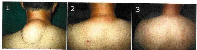
Figure 2: Preoperative (1), early postoperative (2) and late postoperative findings (3) at the same patient with lipoma on the upper dorsal region treated with liposuction

Photo documentation of two cases is shown in Figure 1 and 2.