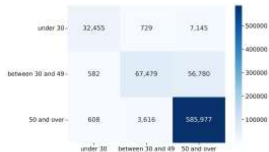
Figure 1 Confusion matrix for original data with three age groups analysed

Another thing which can be noted is that the performance of the models decreases when patients aged 50 and over are divided in two groups, with DT dropping from 99% to 98%, RF dropping from 100% to 99%, and XGBoost significantly dropping