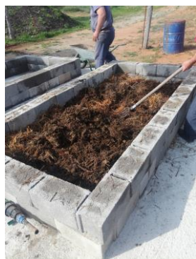
Figure 2. Filling and mixing organic waste in vermicomposting basins.

Throughout the vermicomposting process, additional aeration, moistening, and feeding of the worms were performed (Figure 2). Sampling for chemical and microbiological analysis in triplicate was conducted 0, 60, 150, and 240 days into the experiment.