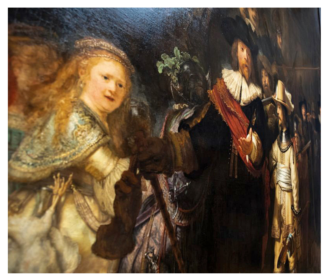
Fig. 9 Master Rembrandt, The Night Watch (1642), Rijksmuseum Amsterdam, detail Сл. 9 Рембрант, Ноќната стража (1642), Кралски музеј во Амстердам, детаљ

escorted by another blond figure slightly visible and dressed in a light blue garment, draws considerable attention due to her incompatibility with the motif of the painting, namely – a group portrait of the city guard. Moreover, she becomes even more interesting due to the fact that she carries a little golden gunpowder bag and a large white chicken that hangs upside down from her waistband. About the significance of this iconographic detail much has been said in reference to the Kloveniers<sup>23</sup>. However, it seems that the personification dimension given to the blond maiden is an underrated coordinate in relation to her true role in the picture, which, to our opinion, has more to do with Rembrandt's emotional analytics of the private life of the portrayed than to the guild of civic militia and its heraldic symbols, as well as his desire for remembrance of the late wife Saskia<sup>24</sup>.