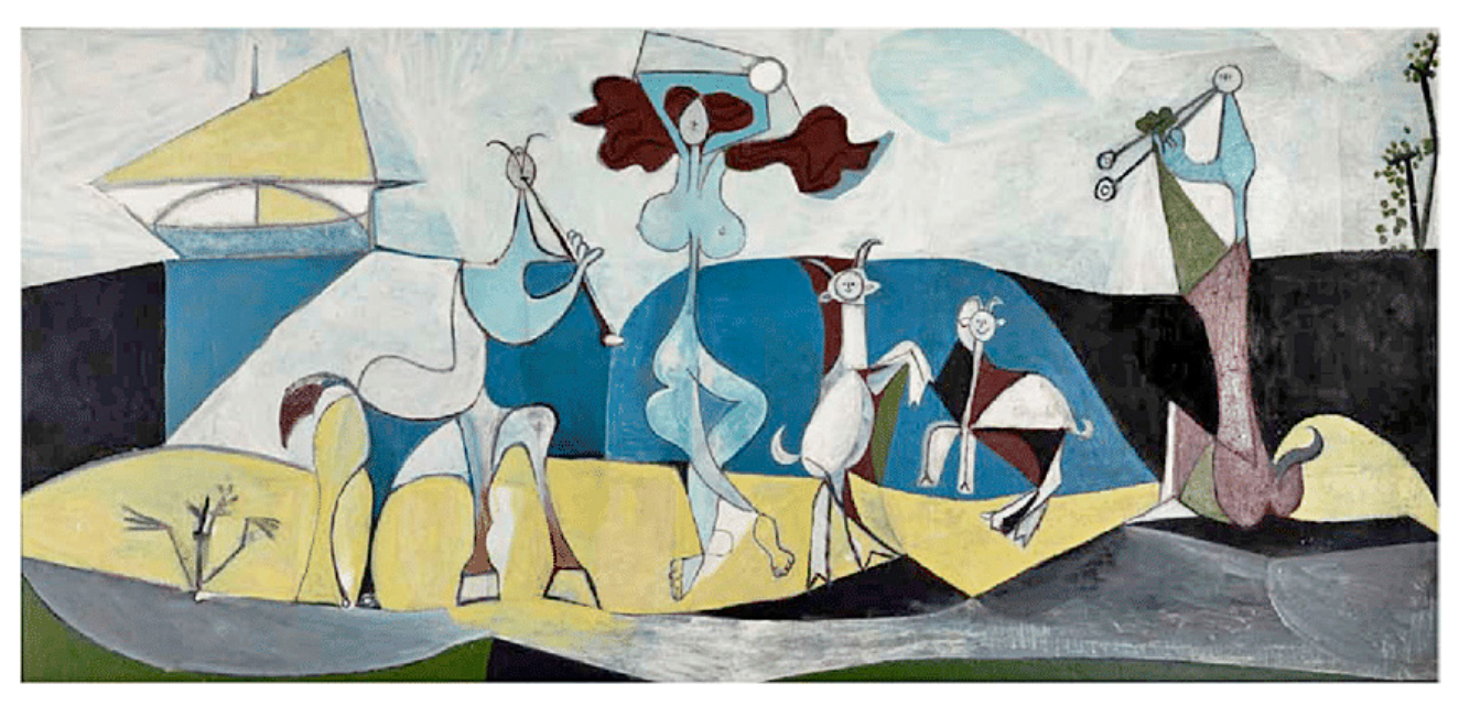
Fig.1 Pablo Picasso, La Joie de Vivre (1946), Musée Picasso, Antibes Сл. 1 Пикасо, Radocma на живеењето (1946), Музеј на Пикасо во Антиб

aclea Lyncestis<sup>3</sup>. Its program concept, iconographic peculiarities, symbolic significance, as well as paint-