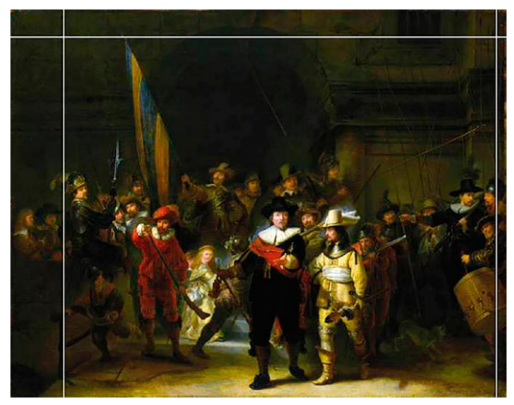
Fig. 8 Master Rembrandt, The Night Watch (1642), original size Сл.8 Рембрант, Ноќната стража (1642), автентични димензии

of the city, who wanted to be celebrated in a group portrait. The movie brilliantly discloses the deceitful