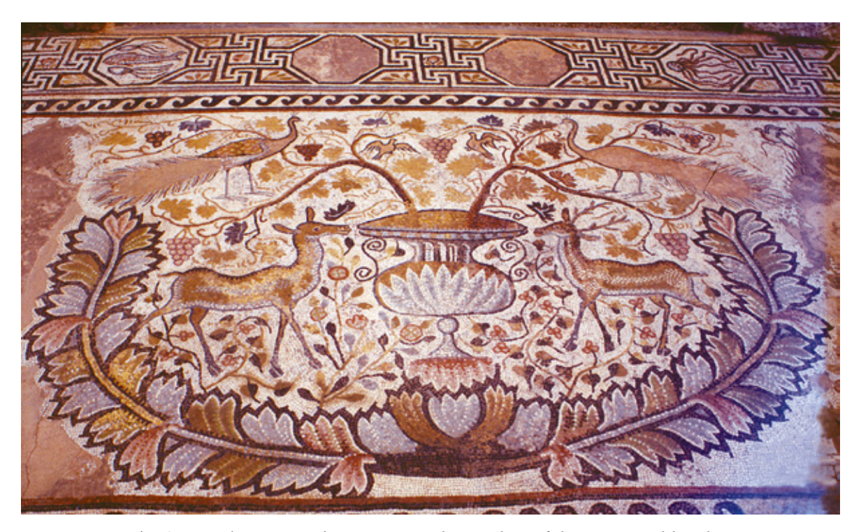
Fig. 3 Heraclea Lyncestis, Mosaic in the narthex of the Episcopal basilica (turn of the 6<sup>th</sup> century), central portion Сл. 3 Хераклеја Линкестис, Мозаикот во нартексот на Епископската базилика , (крај на V - почеток на VI век), централен дел

fourth season of the annual cycle represented in the mosaic. However, regardless of the inventive and lucid approach to the thematic significance of the Heraclea mosaic spectacle, we have to bear in mind that there are four seasons, thus the composition should have had four animal depictions (instead of five or six)* – one for each season of the annual calendar. Furthermore, why would the fall have been depicted as a brutal act of a hunt ("the leopard rips into its prey bleeding beneath its claws"10), while the other animals stand as individual symbols with their own zoomorphic integrity and character? Nevertheless, I agree with Madame Kolarik in relation to the subtext of this interpretation of the panther as an image ideologically related to the cult of Dionysus, as are the other animals depicted within the Heraclea mosaic arrangement<sup>11</sup>.