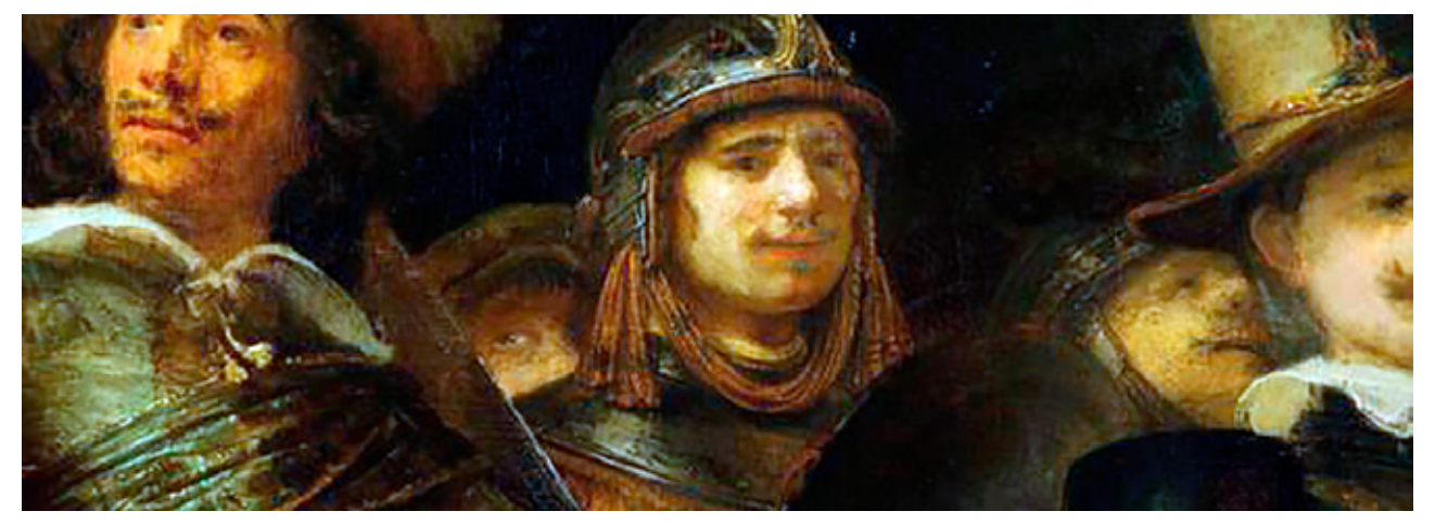
Fig. 12 Master Rembrandt, The Night Watch (1642), Rijksmuseum Amsterdam, detail Сл. 12 Рембрант, Ноќната стража (1642), Кралски музеј во Амстердам, детаљ