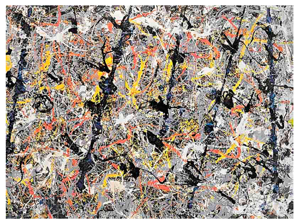
Fig. 14 Master Pollock, Number 11 (Blue Poles) , 1952, National Gallery of Australia in Sydney Сл. 14 Полок, Број 11 (Тажни полови ), 1952, Национална галерија на Австралија во Сиднеј

frescoes of Marko's monastery – highly appropriate to the dramatically nuanced historical heroism of King Marko's reign, as well as the mosaic pavements of Heraclea Lyncestis - filled with a refined spectrum of religious messages transmitted through the medium of visual creation, are, also, works of art that go beyond the rational sphere of expressive ideas channelized into impressive spectacles. Looking at the colossal composition at Heraclea, gazing at the spectacular fresco panorama in King Marko's monastery,