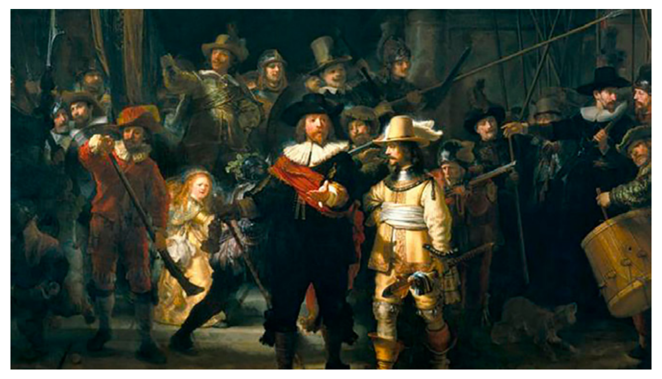
Fig. 7 Master Rembrandt, The Night Watch (1642), Rijksmuseum Amsterdam Сл.7 Рембрант, Ноќната стража (1642), Кралски музеј во Амстердам

The historic allusions that permeate the visual context of the fresco programme of King Marko's monastery are indisputable. Diversified in their iconographic concept and associative in the painterly structure, they are much more than pure artistic inventions of their multitalented authors; in the times of inglorious political dependency of the khtetor and his compromising vassalage to the Ottoman invaders, the endowment of King Marko was not only a religious commission done in devotion to orthodoxy. It was an illuminative insight into the suffering fate of his territories plundered by the unfaithful and bloodthirsty newcomers. The entire fresco arrangement was designed to reflect the violent atmosphere and the brutal social environment as the most immediate outcomes of the Turkish invasion. In that regard, the Biblical tales became inspiring fundaments for metaphrasic explication of the real life situations in King Marko's realm torn to pieces by the conquerors and burden with insoluble political issues generated by Serbian aristocracy<sup>20</sup>. Besides the passionately shaped saintly characters, brutal rhythm of dynamic motion, invasive energy of the sights, powerful and contrasting optical effects, as well as astounded vertigo of dark colours, the commissioner had his painters