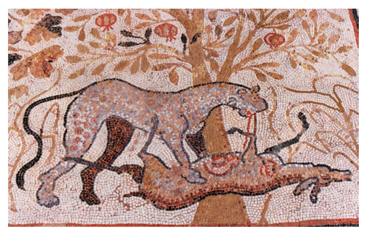
Fig. 4 Heraclea Lyncestis, Mosaic in the narthex of the Episcopal basilica (turn of the 6<sup>th</sup> century), south portion Сл. 4 Хераклеја Линкестис, Мозаикот во нартексот на Епископската базилика (крај на V - почеток на VI век), јужен дел

configured iconographic arrangement of the mosaic executed in the narthex of the Episcopal basilica in Heraclea, the fear of death is but a step towards the ultimate redemption of humanity.