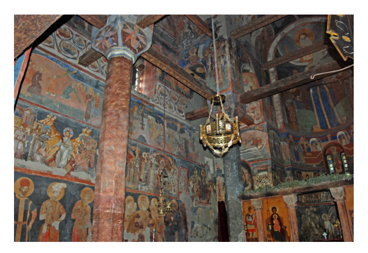
Fig. 5 The church of Saint Demetrius in King Marko's monastery (1376/77), View to the north-east portion of the fresco ensemble Сл. 5 Свети Димитрија – Марков манастир (1376/77), Поглед кон североисточниот дел од живописот на храмот

solved<sup>15</sup>, its painterly decoration is considered as profound and undisputable reflection of current political events over the grim inspiration of the painters who created the fresco programme of the church (Fig. 5). Infused with strong pathos in depiction of the saintly portraits, ennobled with emblematic pictures with powerful expression of emotional unrest, accentuated with the sharp rhythm of kinetic anxiety and permeated with bitter outflow of unsurpassed tension, the fresco decoration of King Marko's monastery displays a spectacular range of nuances devoted to dramatic atmosphere and vigorous passion. Aimed at picturing piercing emotional distress, intense dynamicity and crude energy of unconcealed despair, the art of King Marko's monastery grows from the abyss of ecstatic suffering. The whirl of dark, expressive and saturated colour gamut, funded upon indigo blue tones and dra-