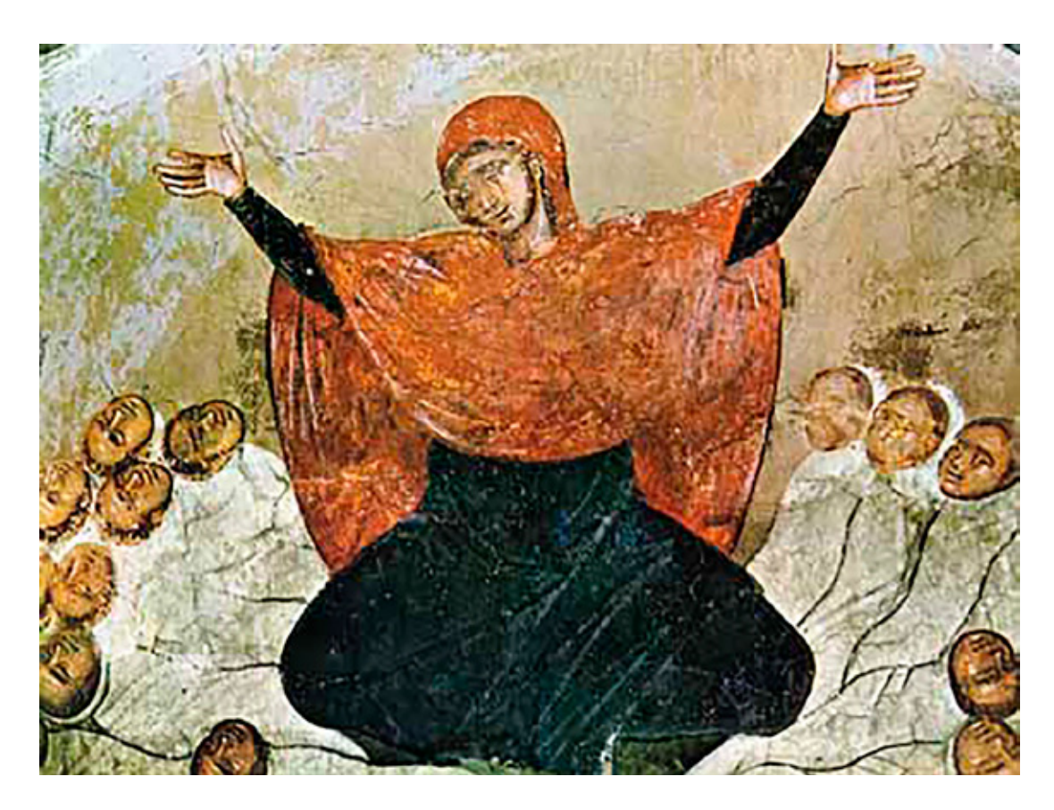
Fig. 6 The church of Saint Demetrius in King Marko's monastery (1376/7), Rachel weeping for her slaughtered children Сл. 6 Свети Димитрија – Марков манастир (1376/77), Плачот на Рахела

depiction in the Gospel according to Mathew (2:18)* was inspiring enough for the creation of one of the most sorrowful vistas in the Byzantine mural painting of all times<sup>18</sup>. Leaving the legendary "sustainability" of the massacre in Bethlehem aside, its depiction and particularly the picture of the comfortless Rachel who laments her offspring seems to summarize the great tragedy ordered by the paranoiac King Herod and realized as a planned execution/infanticide<sup>19</sup> with Biblical proportions.