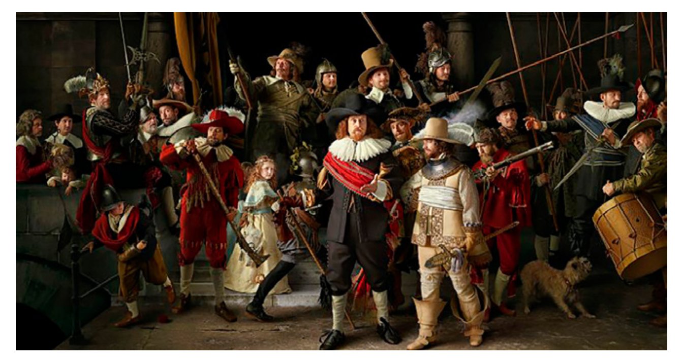
Fig. 10 Peter Greenaway, The Night Watch in 3D Сл. 10 Питер Гринавеј, Ноќната стража во 3D