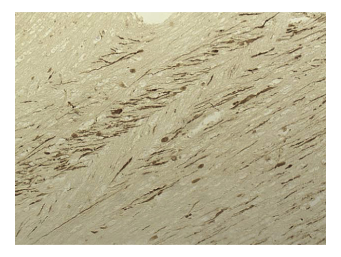
Fig. 2. Traumatic pattern of axonal damage: single or in small groups arranged \beta -APP positive axons are scattered and diffusely distributed (case No 3). b. (×200).

N. Davceva et al. / Journal of Forensic and Legal Medicine 19 (2012) 413-418