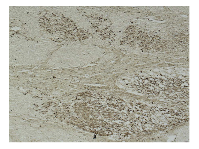
Fig. 3. Linear and geographical patterns of \beta -APP accumulation are a predominantly hypoxic-ischaemic finding (×200, case No 36).

Analysing cases of fall in this study, in three out of ten cases of fall from a considerable height, the diagnosis of DAI was confirmed, but must be noted that four out of seven cases without DAI died immediately, not allowing the diagnosis of DAI by given criteria. Other three cases showed some \beta -APP immunoreactivity but not sufficient for the diagnosis of DAI. In one out of three cases of