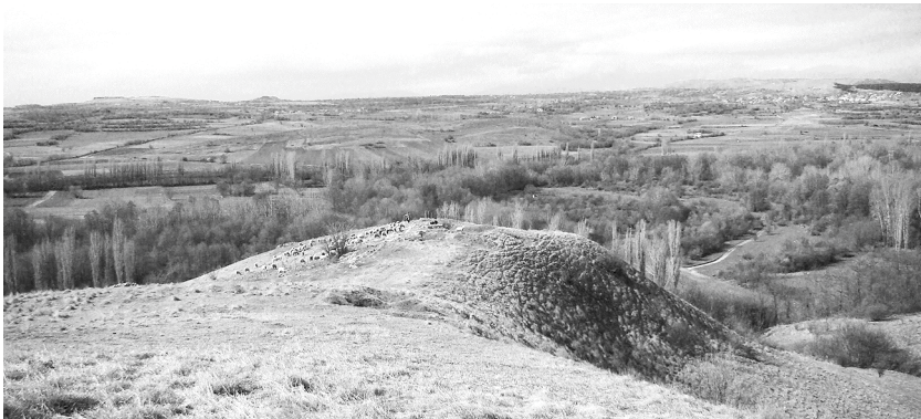
fig. 2–4: Gradište, village of Mlado Nagoričane, planimetry of the Agrianian town; view of the acropolis from the east; view of the lower part of the city, from the acropolis.