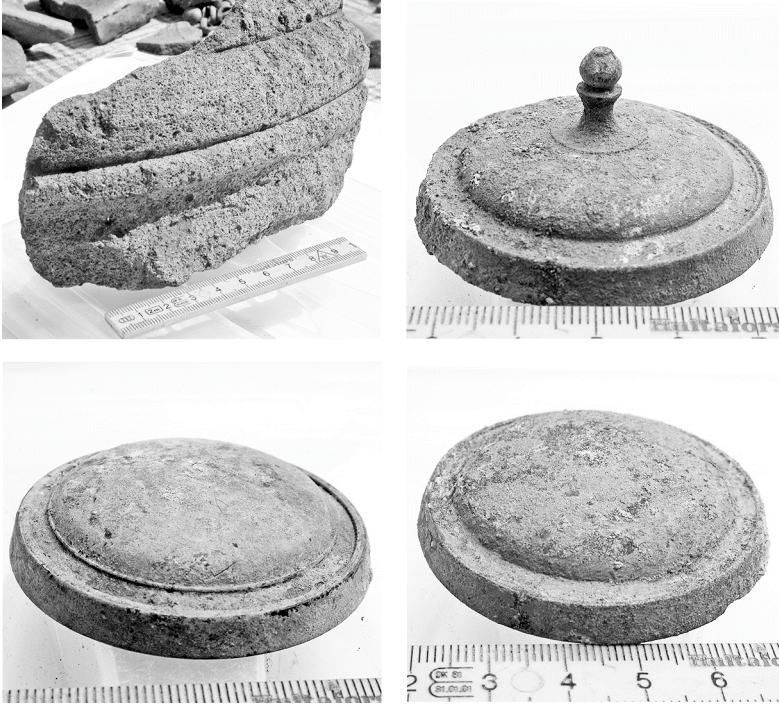
fig. 5–8: A part of the early antique base, probably from an temple in the acropolis; bronze application 1 in the form of a shield (omphalos) for the door of the city temple; bronze application 2 in the form of a shield (omphalos) for the door of the city temple; bronze application 3 in the form of a shield (omphalos) for the door of the city temple.

Among the early Agrianian settlements in the Kumanovo region, several cities and fortresses were more prominent than others. Some of them were located at the archaeological sites of Velja Glava, village of Rugjince, Lipec, village of Murgaš, Gradiški Vrh, Gradište village, Gradište, Pelince village, Gradište between the villages of Mlado Nagoričani and Makreš Kostoperska Karpa / Žegligovski Kamen near Mlado Nagoričani and other smaller fortified settlements.