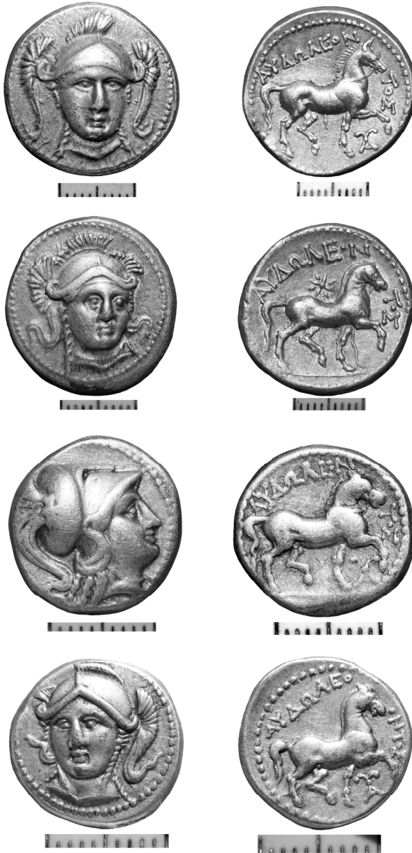
Silver tetradrahmae (9–10), a didrachm (11) and a drachma (12) of Paeonian King Audoleon

Metal objects have also been recorded. Among the registered items were 14 bronze, so-called Iron Age, semi-spherical buttons, as well as a star decorative application, pieces of strip bracelets, two bronze objects of unfamiliar purpose, perhaps a type of jewellery, a part of a handle of