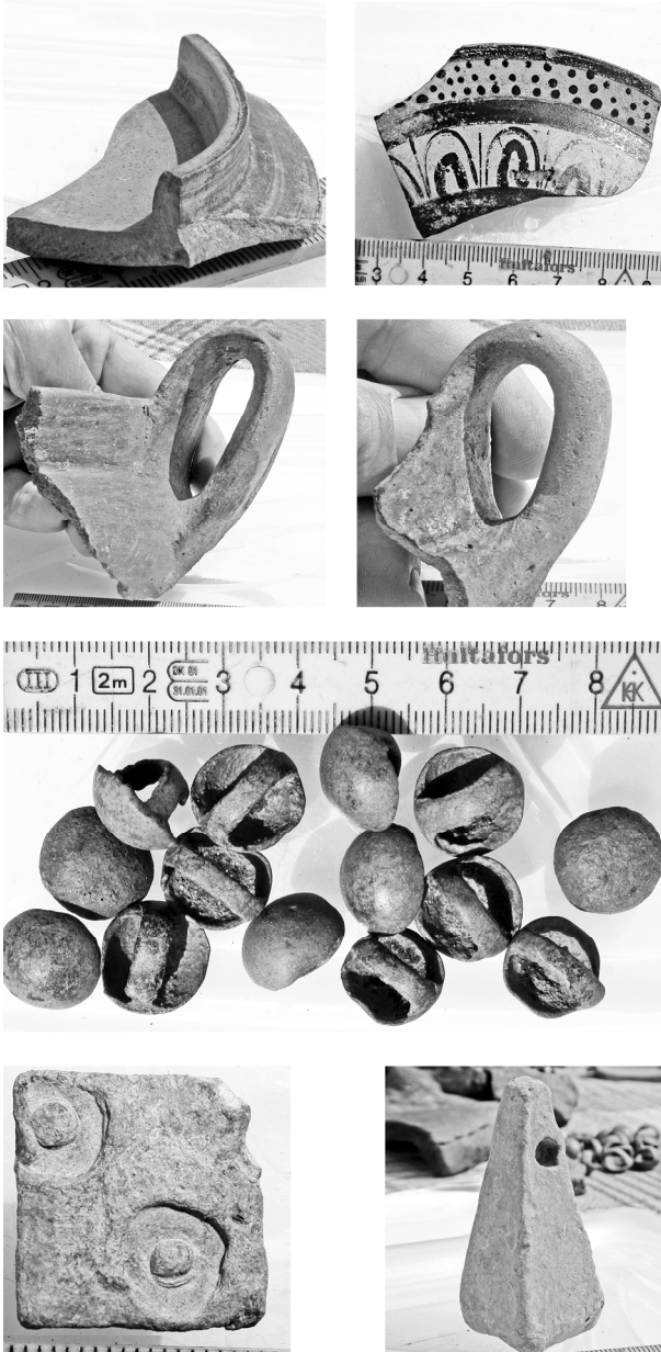
fig. 13–18: Parts of an imported pithos; parts of a cantharos from the archaic period; bronze buttons; lead-type weight in the shape of a small plate, early antiquity; lead-type weight in the shape of a pyramid, early antiquity.

does one not depict the monogram AU, whereas the name of the king ΑΥΔΩΛΕΟΝΤΟΣ can be observed on all other coins, without the title ‘king’ (ΒΑΣΙΛΕΩΣ).