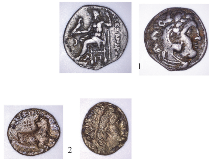
Fig.12. Two coins discovered on the floors from the final use of the palace

iron arrows, which served to attackers to cause a fire, were found in their original position in the rubble and as a part of the burnt floors of the rooms (Fig.13). Their discovery, mainly in the burnt parts of the palace, is documenting in a very picturesque way the moment of the finale destruction of the palace. Because of that, the final period of the palace is commonly correlated with the attacks of the Celts and their military champagne toward the south. After that, the palace was not renewed any more.