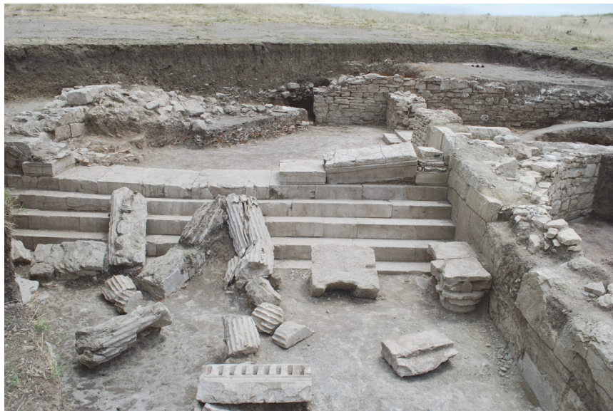
Fig.3. The main façade destroyed in original position with two unfinished Corinthian capitals, left by the outer wall of the palace