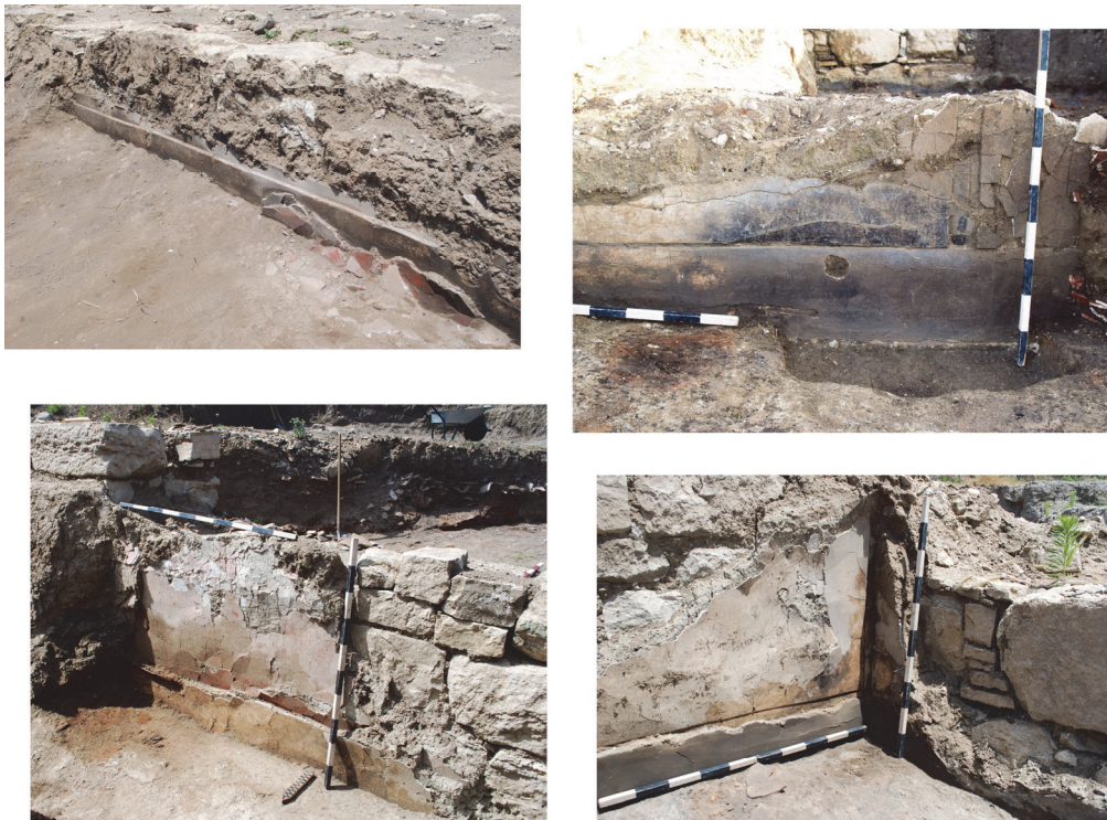
Fig.9. Some examples of fresco decoration from different walls

The outer walls of the palace were built in the lower zone by the cut sandy stone blocks up to the one meter in high, and in the upper zone by the bricks. Internal walls were mostly built by mudbricks, but all of them, as same as the internal side of the outer walls, were decorated by fresco (Fig. 4 and 9). The fresco painting was in geometric patterns, in different colors and in very high level of quality (Fig. 9).