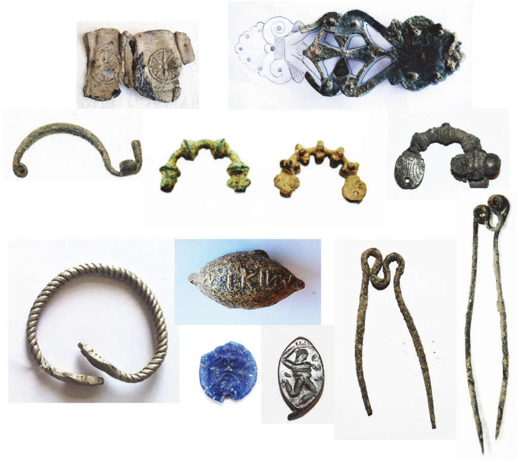
Fig.11. Some small findings from the palace

(Fig.1). This palace was in use through the second half of the IV and the beginning of the III century BC.