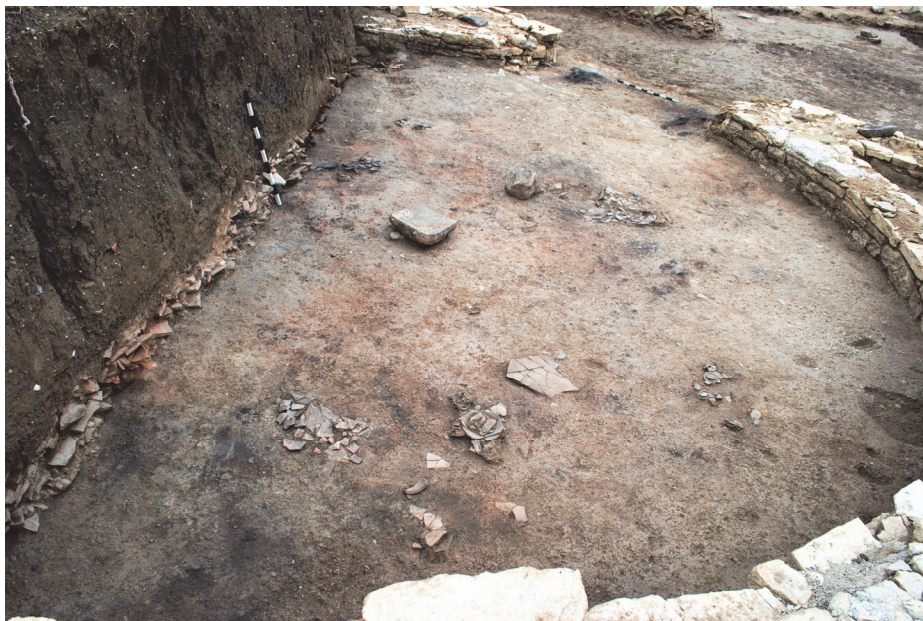
Fig. 6. Tholos room with the cult pit in the floor