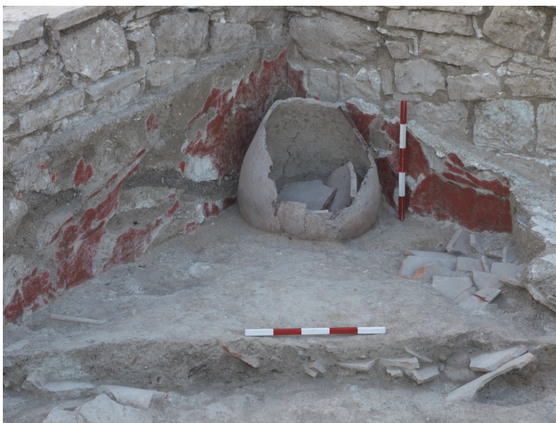
Fig. 4. Apithoi with a part of the wall painting in the so called North-east corridor

Among other rooms there is circular room, named as Tholos room, which occupies a prominent position and area of 9 meters in diameter (Fig.5). It had a separate entrance from the west, which probably constitutes an open crossing, because only in that entrance there are not detected the usual stone threshold with the grooves of the door. The most interesting movable findings are found in that room. Different kinds of gifts were left in smaller cult pits, buried in floor of the room (Fig. 6). The presence of certain types of ceramic vessels and small metal objects, a lot of animal bones in the pits and around them, along with the circular shape and position of the premises, determines this place as a cult area. Such a premise, at the same position, is known from the palace of the Macedonian rulers in Vergina.