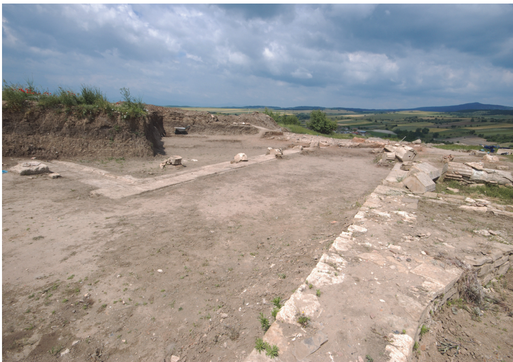
Fig. 8. The central open atrium with the parts of basis eastern and the northern porches