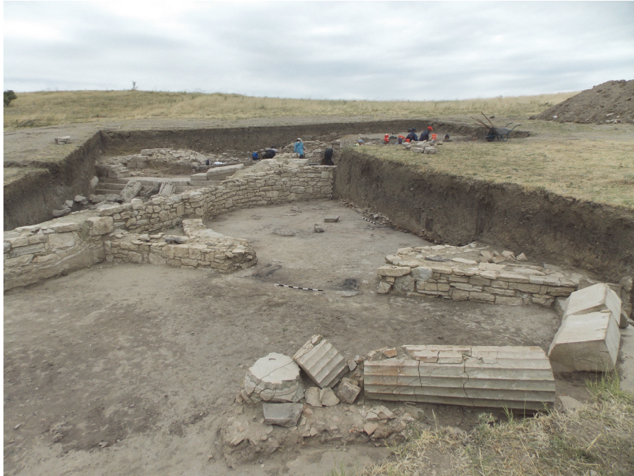
Fig 5. The position of the tholos room in the process of excavation

Special constructive elements in the atrium are the stone canals for collecting and draining of the rain waters from the roofs of the porches (Fig.7).