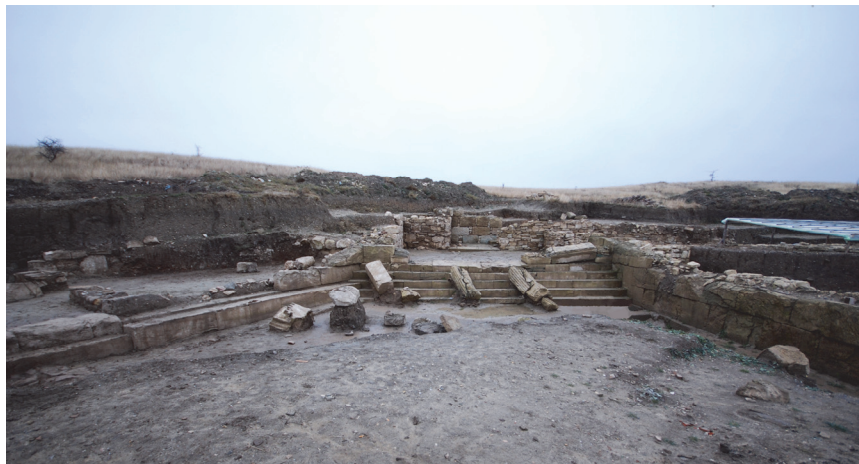
Fig. 2. The main entrance room with the surrounding premises

there is a central entrance room with an open representative entrance on the west and a side entrance to the opposite eastern wall (Fig. 3). From that entrance part you can enter in a long room, which stretches along the eastern side of the palace, from where, through a specifically shaped passage, it enters into the central opened atrium. The walls of the room are decorated with fresco decoration performed in horizontal zones in red, black and white (Fig. 4). As an inventory, only a pithoi was discovered in situ position in its north-eastern corner. According to that it is possible to determine this room as a passage or north-east corridor (Fig.1).