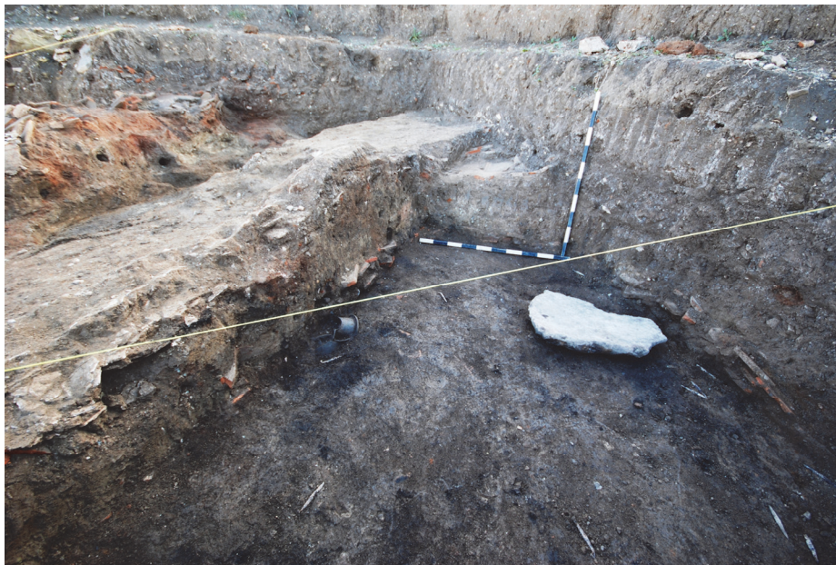
Fig.13. Fire arrows in original position on the floor of the eastern porch

iron arrows, which served to attackers to cause a fire, were found in their original position in the rubble and as a part of the burnt floors of the rooms (Fig.13). Their discovery, mainly in the burnt parts of the palace, is documenting in a very picturesque way the moment of the finale destruction of the palace. Because of that, the final period of the palace is commonly correlated with the attacks of the Celts and their military champagne toward the south. After that, the palace was not renewed any more.