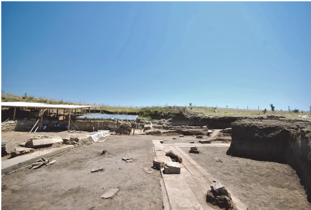
Fig. 7. A part of the central open atrium with the basis of colonnade to the northern porch