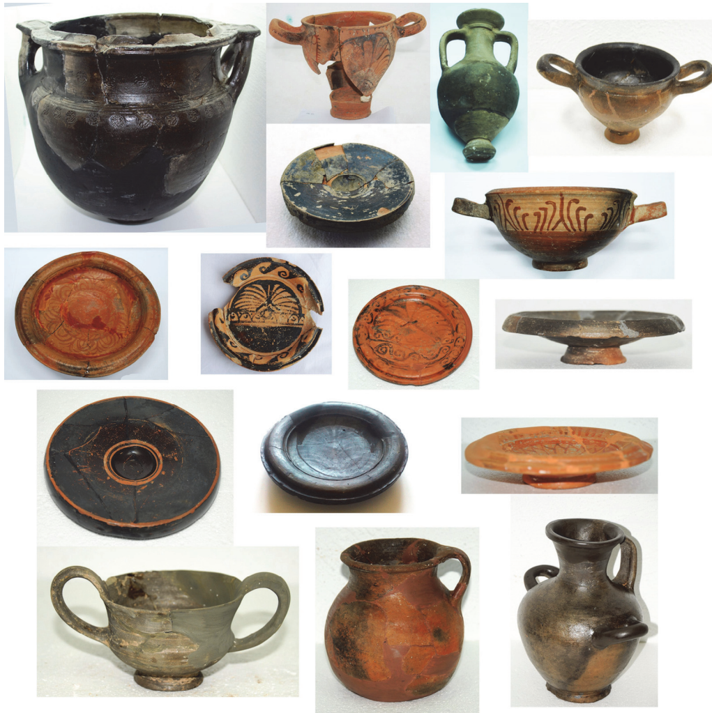
Fig.10. Some ceramic findings from the palace

furnished and red figurate imported pottery are encountered (Fig.10). Also, some iron tools, bronze pins, fibulas and some other jewelry forms are presented, as same as the typical red painted roof tiles (Fig.11). All of them are characteristic for the second half of V century BC and first half of the IV century BC. 7