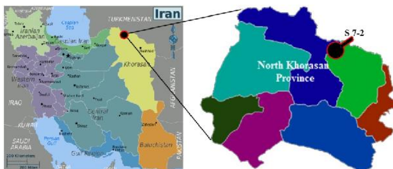
Figure 1. Study area of the S7-2 watershed, the Shirindareh River Basin, Iran

The geological analyses (geological formations of North Khorasan province, including those in the study area of the S7-2 watershed) were based on the research of the National Geological Survey Organization (NGS) of Bolourchi (1987).