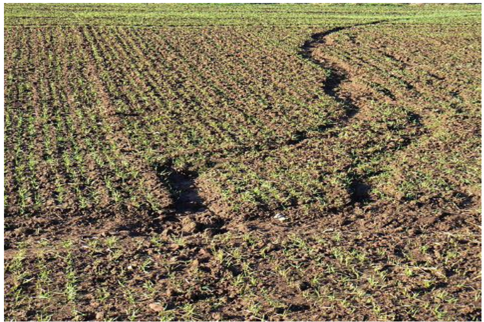
Fig. 2. Soil erosion caused by heavy rain