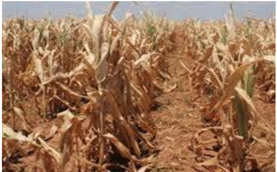
Fig.4. Consequence of drought in year 2003 (www.agroklub.com)

small used regardless on natural riches such as land and water. Riches of soils lay in the fact that there is 244,151 ha favourable soils for irrigation or 9,4% from total agricultural land and 588,164 ha moderate favourable soils or 22,7% from total agricultural land (Husnjak, 2007). Riches of water are in the fact that there are many watercourses, natural and artificial lakes, accumulations, fish-pond, and ground water. According to Mayer (2004) Croatia disposal on 32,800 m<sup>3</sup> water/capita/year and belongs in group of countries with the most riches on water on the World. But then after due to the occurrence of frequent and prolonged droughts, that is, risky agricultural production, in 2005 the Government of the Republic of Croatia approved the project national project, name "National Project for Irrigation and Management of Agricultural Land and Water". The project provides guidelines, short-term and long-term goals and states that by 2020 irrigation will be applied to 65,000 ha or about 6% of arable land. From year 2004 until 2016, new irrigation systems for 13,000 ha of agricultural land have been built (Đuroković et al., 2016). With previous irrigation systems from 9,264 ha (Tomić et al., 2007) and newly constructed systems, it is possible to irrigate 22,264 ha or about 2% of arable agricultural land.