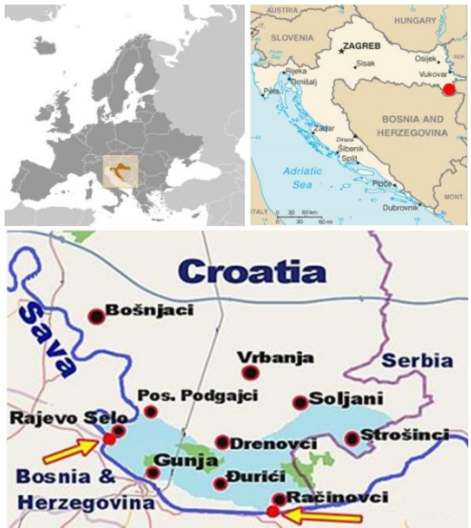
Fig. 1. Flood in eastern Croatia after water is broke embankment along Sava river (area of flooding is marked blue colour)

the flooding danger is over, water is discharged from the retention back to the watercourse. There are several retention areas in Croatia and are located in the central Posavlje region. The retention area for the river Sava and it is tributaries is the Natural Park Lonjsko polje, which, owing to it is size and natural characteristics, is the largest protected wetland area not only in Croatia but it he entire Danube region. Besides their role of natural retention in watercourse regulation, wetlands are important because of their ecological value, since they have a positive effect on the water environment. Besides appearance of unusually large amounts of water on certain area, which are caused heavy rain, break of embankments and dams can cause flood, as was in eastern part of Croatia in year 2014 (Figure 1).