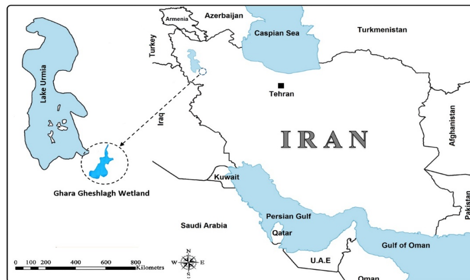
Figure 2. The study site.