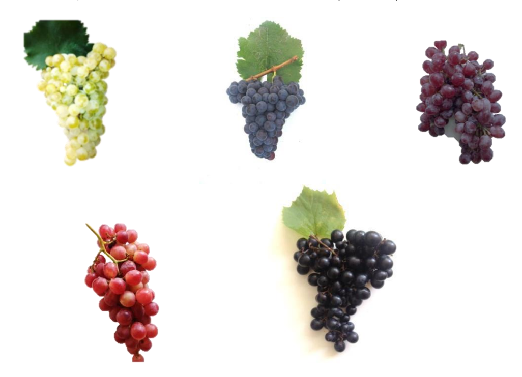
Figure 1. Examined varieties: Belo zimsko, Stanusina, Crn valandovski drenok, Crven valandovski drenok and Palieri (standard)

Figure 1 shows the examined varieties in the following order: Belo zimsko, Stanusina, Crn valandovski drenok, Crven valandovski drenok and Palieri (standard).