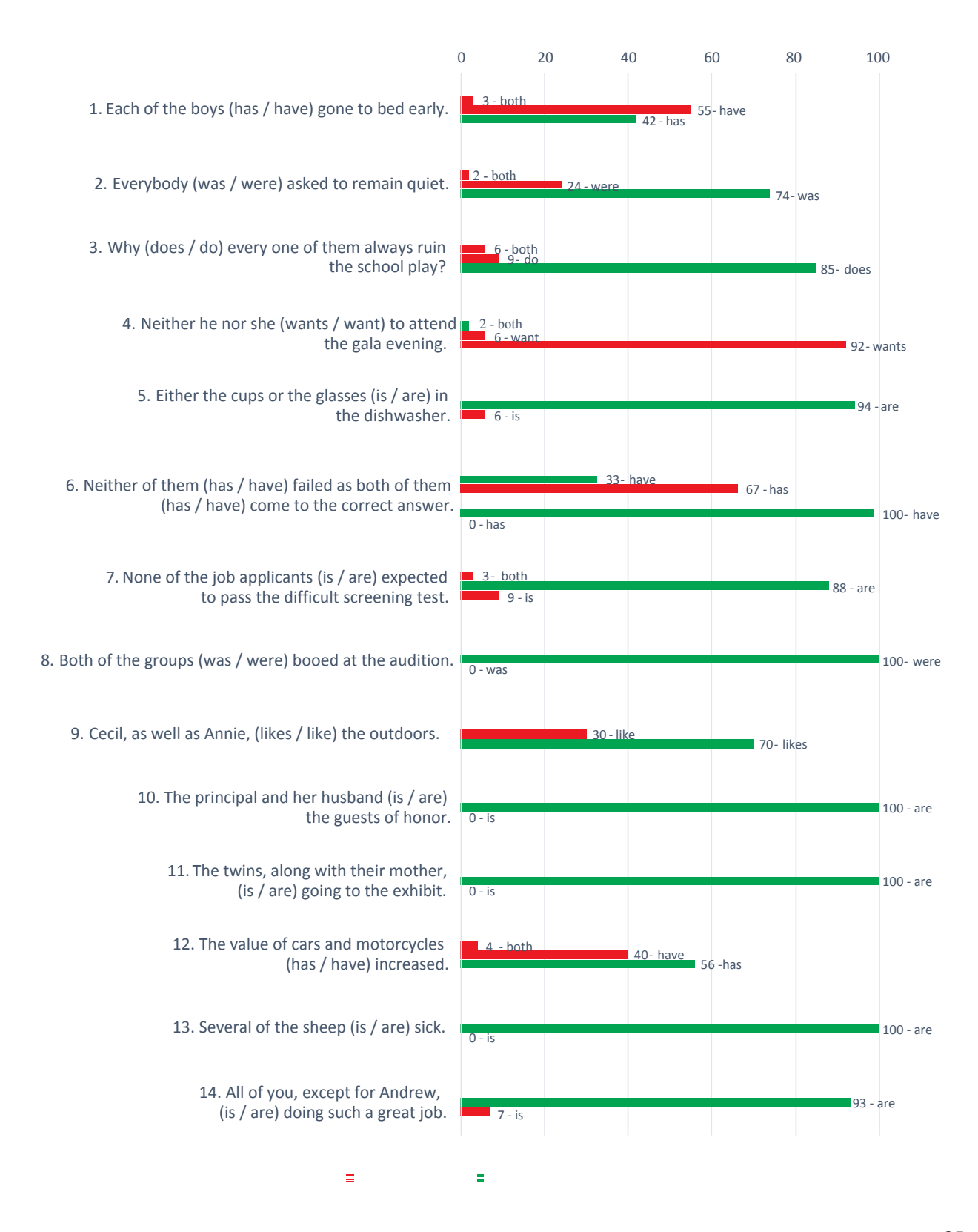
Figure 1: Percentages of correct and incorrect answers from the questionnaire (Year 1).