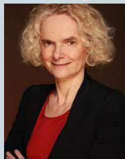
NORA VOLKOW (NIDA, USA) Update on Prevention and Treatment of Dual Disorder