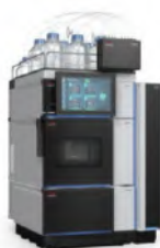
Vanquish Horizon UHPLC