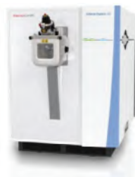
Orbitrap Exploris 240