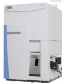
iCAP Q plus ICP-MS