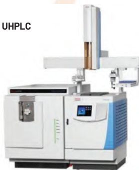
Orbitrap Exploris GC maseni spektrometar