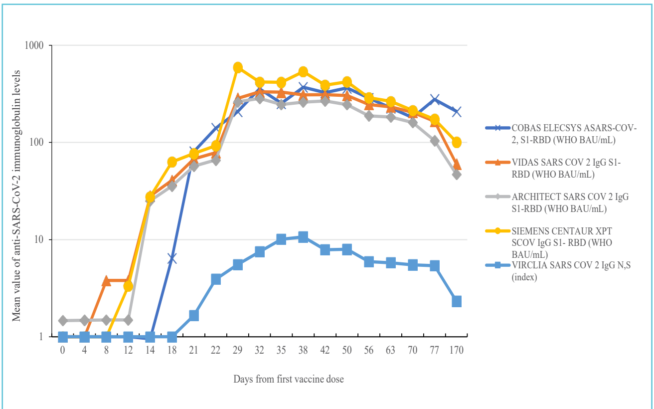
Figure 1 Kinetics of anti-SARS-2 antibodies following Gam-COVID-Vac-Adeno-based recombinant vaccine. Values are shown as mean \pm SD

Abbreviations: Ig, Immunoglobulin; N, nucleocapsid; RBD, receptor binding domain; S, spike protein.