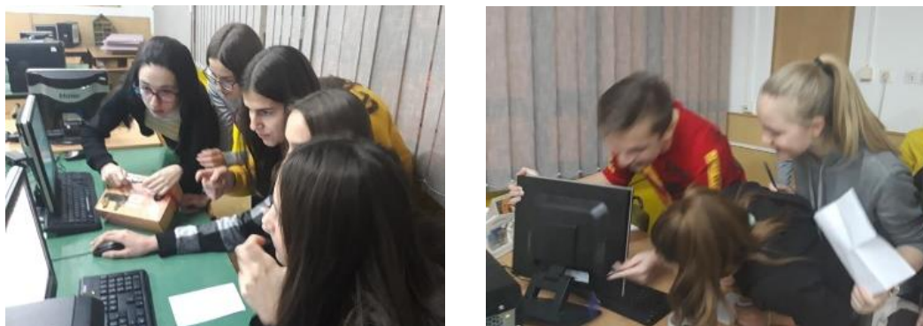
Fig. 2. Educational escape room (permissions for taking students' photos are provided in advance)