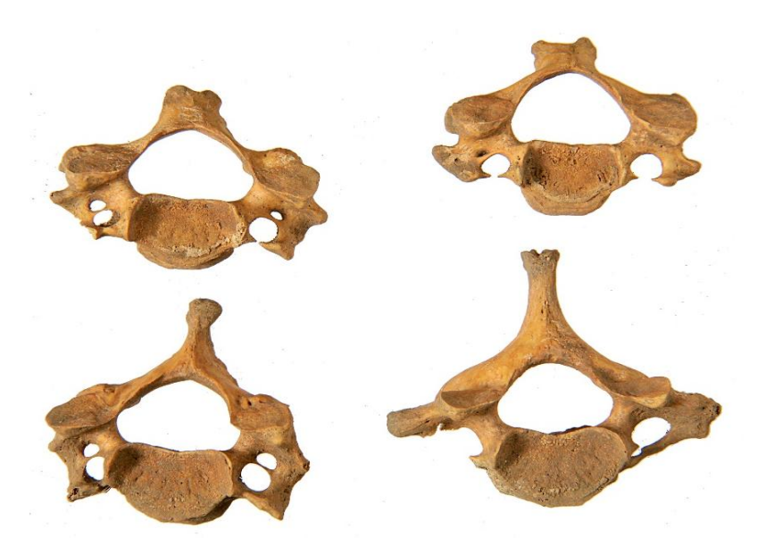
Fig. 4. Cervical vertebra of 20 to 25-year-old female showing foramina transversaria partita, foramina transversaria aperta, and foramina transversaria asymmetrica