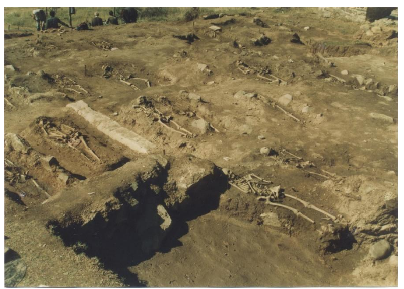
Fig. 1. The necropolis of Vinica fortress (Vinichko kale)

During these excavations 102 skeletons have been exhumed and examined [6]. Our study sample comprised 72 well preserved skeletons from the documented collection belonging to individuals aged 20 to 65 years (Figure 1). Since most of the skeleton elements were present, age and sex estimates were performed with reasonable accuracy using standard anthropological techniques [7]. Figure 2 presents the demographic composition of our medieval population sample.