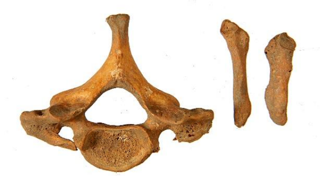
Fig. 5. Bilateral costa cervicalis and foramen transversarium apertum (FTA) in 30 to 35-year-old female