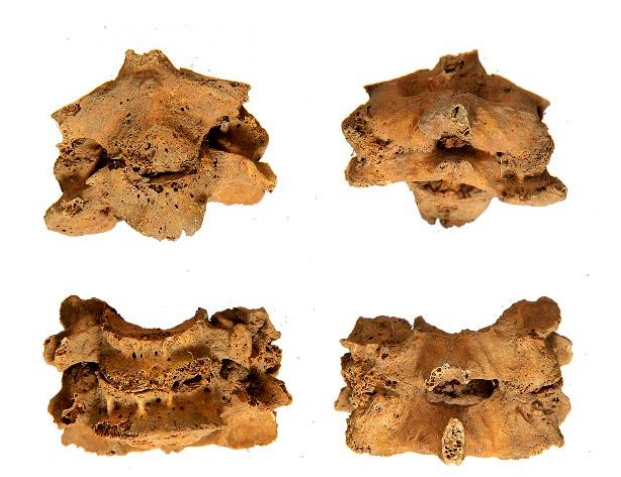
Fig. 7. Double cervical block C2/3 and C5/6 in 55 to 60-year-old male