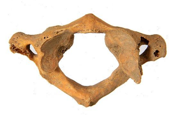
Fig. 6. Right facies articularis atlantis partita in 30 to 39-year-old male