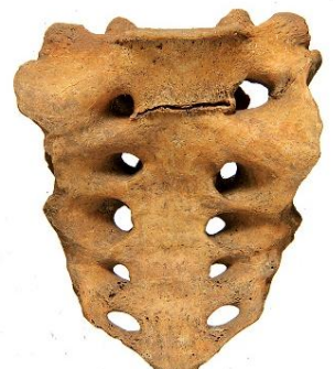
Fig. 8. Associated bilateral ponticulus posterior atlantis with sacralization (combined fusion) in 30 to 35-year-old female