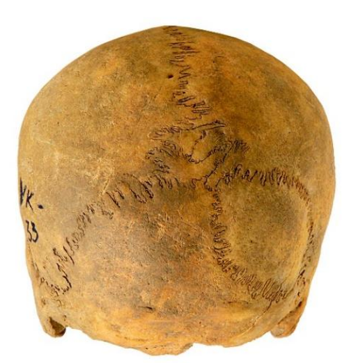
Fig. 3. Os incae laterale dextrum, associated with ossicula suturae sagittalis and torus occipitalis in a 50 to 55-year-old male