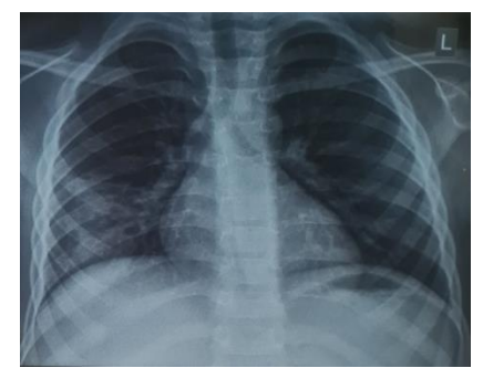
Figure 1 . Chest X-ray on admission: Roumd consolidation in the right low lung lobus

The radiogram of the chest showed round consolidation in the right low lung lobus, with no improvement of the next x-ray taken after a week of therapy.