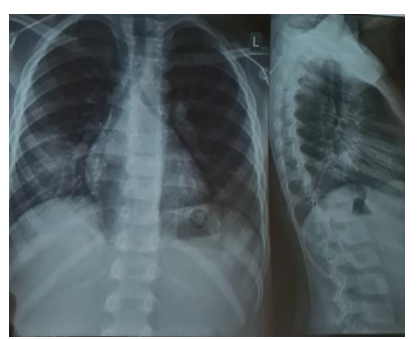
Figure 2. Chest X-ray 1 week after therapy: no improvement of the finding

Microbiologicaly, we isolated IgM Mycoplasma pneumoniae from pneumoslide, and also Staphylococcus aureus –MRSA from the sputum. Also, Sphingomonas paucimobilis was isolated from blood culture. Because of the several bacterial isolates, additional immunology tests like immunoelectrophoresis (IgA, IgG, IgM) were done and all of them were with results in normal ranges.