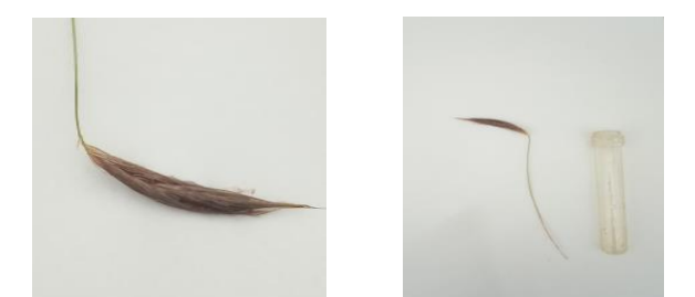
Figure 4. With rigid bronchoscopy removed grass – Hordeum murinum

After the intervention we observed completely clinical recovery of the lung findings, as well as radiological improvement.