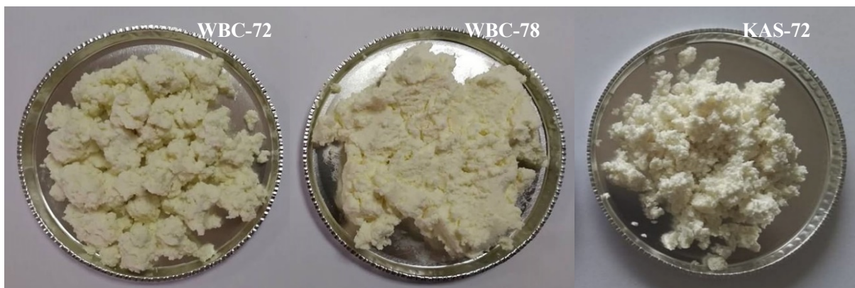
Figure 4. Visual appearance of Urda

1 Mean value (n = 15) ± standard deviation (SD). 2 Mean value (n = 10) ± standard deviation (SD). Different letters in the same row are statistically significant (Tukey test, p<0.05). WBC - White brined cheese. KAS - Kashkaval. T PM - pasteurization temperature. L* lightness (100 white/0 black), a* (+red/-green), b* (+yellow/-blue). WI - Whitening index. YI - Yellowish index. Total (100) - sum of values of appearance (10), body texture (40) and flavor (50).