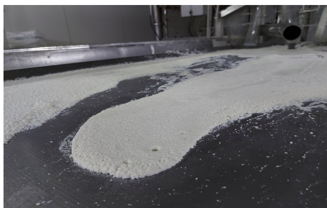
Figure 3. Visual appearance of Urda obtained from whey WBC-79