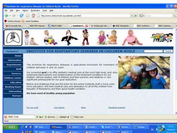
Figure 2. The web based medical information system in the Institute for respiratory diseases in children-Kozle.

Implementation of telemedicine services is lengthy and practically a never ending process. We are currently at the initial stages where a couple of hospitals are included in the pilot project: The Institute for respiratory diseases in children-Kozle and the University clinical center in Skopje. Due to the lack of a modern Medical Information Systems (MIS) in the hospitals, the project had to start from scratch. We developed the initial Web based MIS to be used by the staff at the Kozle children's hospital. Since the hospital cannot afford to maintain an IT department, the MIS is hosted on the Internet Service Provider's servers. Since connectivity speeds are high enough when using WiMAX, there is no need to host the MIS locally at the hospital. The MIS is developed as a web application that can be accessed by a common Internet browser. The staff at the hospital can browse the MIS, log in using their username and password and access patient's data. The homepage of the web application is presented in Figure 2.