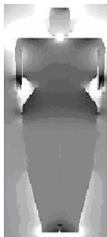
Figure 3 – A longitudinal section Слика 3 – Лонџиџудинален џресек

The first is related to electric field in human determination when exposed to a normalized value of the incident field (1 kV/m), from a power line at 50 Hz. The power line is defined with its geometry, and the human is positioned under it, on perfect ground. That means that during calculations, the ground is considered as a perfect surface in taking account of its influence. The human body is considered as a homogenous medium with relative permeability \epsilon_r and conductivity \sigma , as average values of those quantities for tissues of a specific frequency, accordingly [10]. The results for the electric field in a human being can be given in a longitudinal or a cross section of the human body. Some of the obtained results are presented in Figure 3. Figure 3 represents the electric field distribution in longitudinal section on the same surface as the power line. In the Figure the brighter shadows represent a stronger field. It should be mentioned that the bright zones which appear especially on the edges are the result of a rather rough model representation. The results show that electric field values in such a case are within recommended limits.