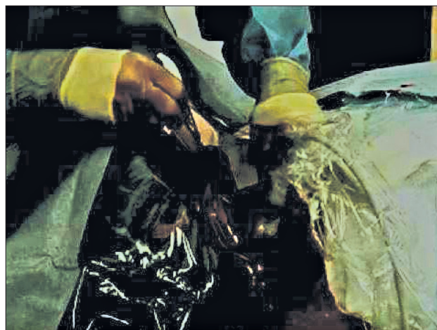
Figure 1. Ultrasound guided catheterization of the jugular vein with a short axis out-of-plane approach

For the ultrasound guided catheterization, an ultrasound machine General Electric e-Logic and a linear transducer 5 to 10 MHz was used. Asepsis was achieved with sterile gel and sterile cover for the probe, Figure 1. Figure 2 and Figure 3 show