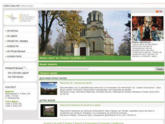
Figure 1: Main page of video section of CDNH portal

Consequently, additional web pages for this purpose were made on the portal. This pages offer an easy way for listing the videos by type, searching videos by keyword and displaying the videos. Additionally, we produced accompanying admin pages to manipulate with the data associated with the main pages, and to add new video projects.