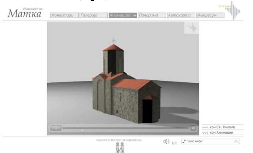
Fig. 4. 3D model of one of the monasteries in the Matka region

Among the materials included in the project there were rich picture galleries that present the monasteries, shown in Fig.3. Also, 3D models of all monasteries were made giving the full understanding of their architecture (Fig. 4).