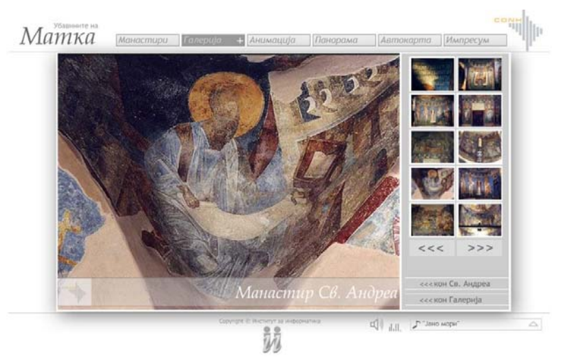
Fig. 3. Part of the picture gallery of the project "Ubavinite na Matka"