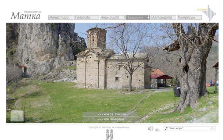
Fig. 5. Panorama view of one of the Matka's monasteries

The region was shown using panorama views, too (Fig. 5).