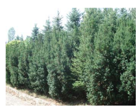
Figure 1: Group of trees from Taxus baccata L. – complex 'St. John', settlement Zlokukani, Skopje

Figure 1 shows group of trees and Figure 2 topiary tree of Taxus baccata L. with pyramidal shape.