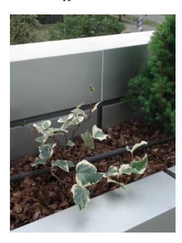
Figure 10: Hedera algeriensis 'Gloire de Marengo' -balcony foliage in a public facility 'Tetraktis' in the complex of 'Mida Motors', settlement Karpos 2, Skopje

Table III shows resistance to low temperatures of the representatives of genus Hedera L.