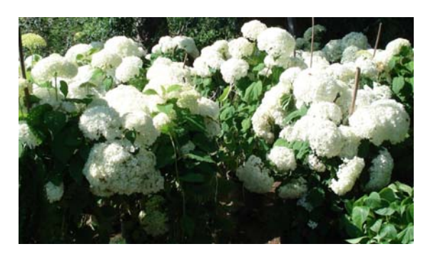
Figure 4: Group of plants from Hydrangea arborescens 'Annabelle' – private yard, settlement Center, Skopje

The most often used are Hydrangea macrophylla Thunb. and Hydrangea arborescens 'Annabelle' (Fig. 4). Hydrangea macrophylla Thunb. is the most popular type. It can be found in our regions from a very long time ago, but today are used large number of new cultivars different by color of flower ( Altona, Amethyst, Ayesha, Enless Summer, Penny Mac, Dooley, Forever Pink, Harlequin, Ravel, Nikko Blue etc). They can withstand temperature of -30°C to -20°C. Hydrangea arborescens 'Annabelle' is characterized with higher growth, withstands temperatures up to -40°C and richly blooms even after the coldest winters.