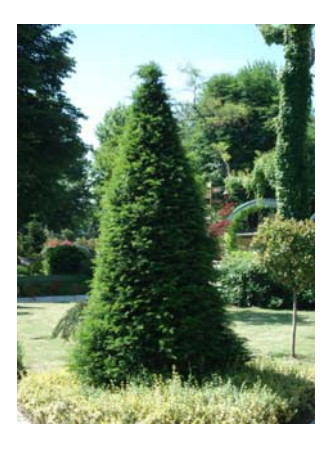
Figure 2: Topiary tree of Taxus baccata L. – 'Horti expert', settlement Karposh 2, Skopje

Table I shows the representatives of the genus Taxus , their shape and color as basic morphological characteristics and the maximum size they can reach.