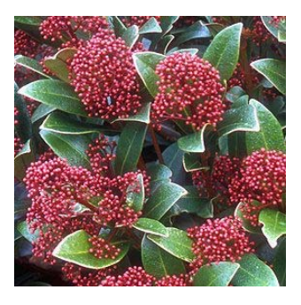
Figure 5: Skimmia japonica 'Rubella'

The leaves are elliptical egg-shaped, leathery and thick. It is specific by it's with red and white flowers, gathered in grape-like flowers that stand up. Skimmia japonica Thunb. has round fruit with red to black color which remains on the branches throughout the winter. In our country, we are familiar with the cultivar Skimmia japonica 'Rubella' (Fig. 5). It can be found in rich and moist, well-drained soil, in shadow and semi-shadow. Withstands polluted air temperatures up to -20°C.