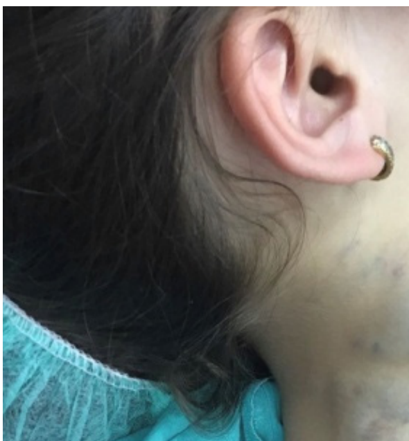
Fig 3. VM on the neck before sclerosing intervention