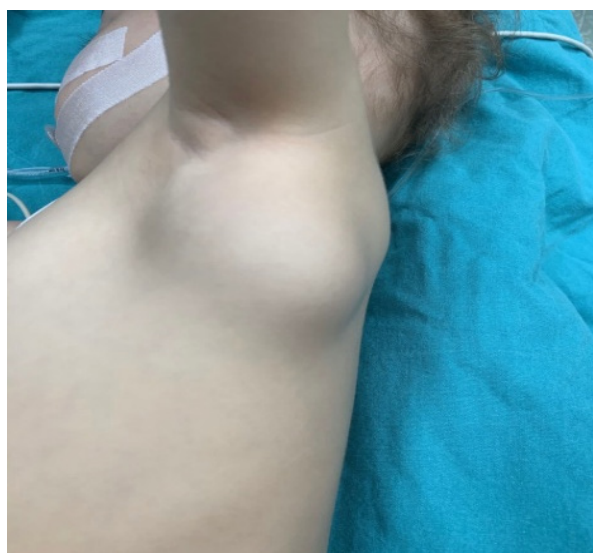
Fig 5. VM of left axillar region, preoperative

tive phleboliths were found in all children. No postoperative complications were reported with normal findings at the follow-up ultrasonographic studies. The histopathologic findings described: “benign formation of widened venous vessels with no signs of malignancy”.