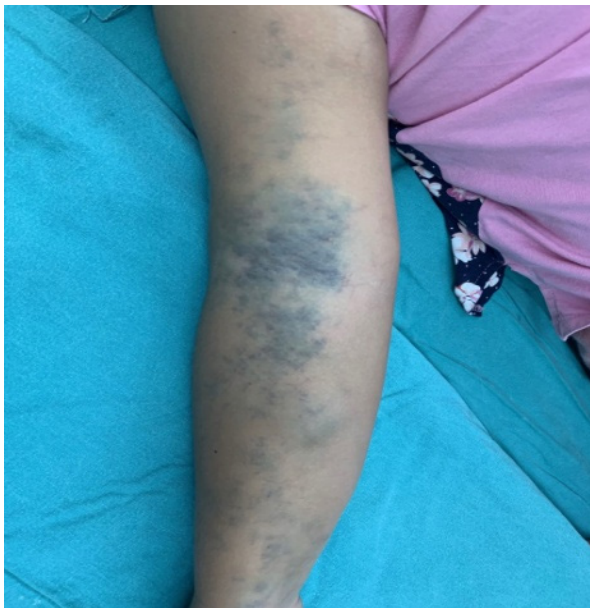
Fig 1. VM on the arm before sclerotherapy

tion on the neck due to an intermittent pain that limited mobility of the neck (Fig.3). The procedure with bleomycin as sclerosing agent was performed in the operative theater under general anesthesia. Follow-up examinations revealed regression of the change not only from functional but from aesthetic aspect as well (Fig.4).