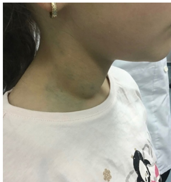
Fig 4. VM after two sessions of sclerotherapy