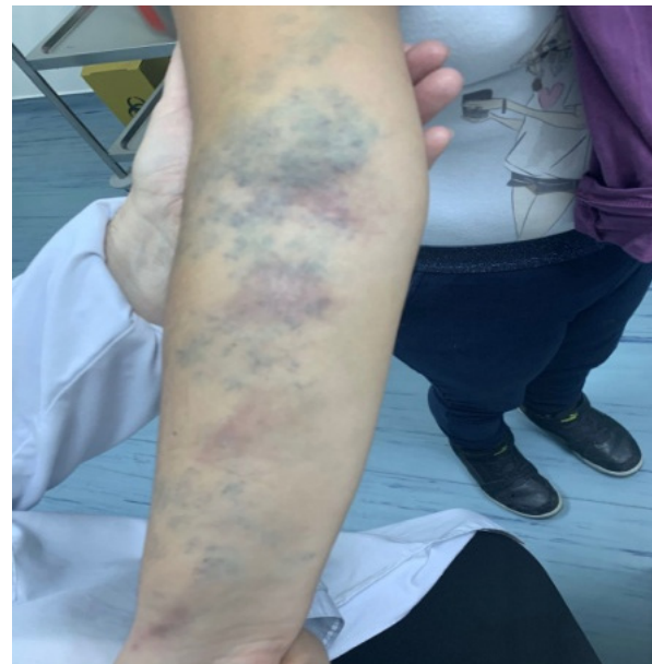
Fig 2. Outcome after one session of sclerotherapy