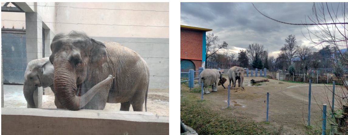
Figure 1. The elephants in their indoor (left) and outdoor (right) enclosure

unified protocol that was used for the welfare assessment. This protocol contained the following sections: nutrition, physical health, environment, behaviour and management. Each of these five sections had a number of questions that, depending on the assessment, were scored as acceptable/questionable/unacceptable. Husbandry guidelines (14, 15) were used as a reference base for good animal welfare for the elephants. A more detailed assessment of elephant behaviour was performed by observing their daytime activity and performing a Qualitative Behaviour Assessment (QBA) (Table 1).