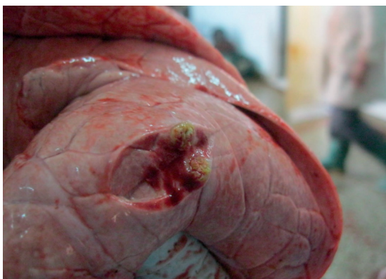
Figure 2. Tubercle in lungs