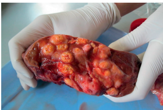
Figure 3. Multiple tubercles in lungs

The distribution of the visible lesions from the sampled animals is shown in Table 2 and the prevalence of visible lesions per organ in Table 3. The highest prevalence of tuberculous lesions in the lymph nodes was 47.47%, detected in MdLNs (CI 95%: 37.63-57.31%) and the lowest was 9.09%, detected in the MsLNs (CI 95%: 3.43-14.75%).