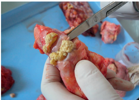
Figure 1. Caseous necrosis in a mediastinal lymph node

Typical tuberculous lesions (Fig. 1, 2 and 3) were detected in 62 animals (33%). Generalized bTB was diagnosed in 3 animals.