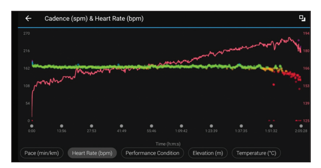
FIGURE 1: Cadence and heart rate.

Heat stroke during exertion can occur in the first 60 minutes during exertion and can be activated without