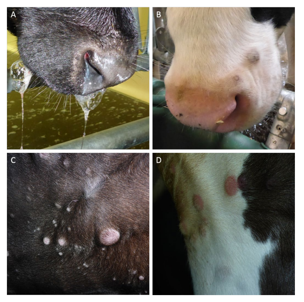
Figure 2. Clinical reactions of cattle following experimental infection with LSDV-strain "Macedonia2016". In cattle with severe clinical signs, excessive salivation and nasal discharge ( A ), as well as sporadic to generalized skin nodules ( B–D ), could be observed.

The observed clinical reactions differed between the four infection groups but also showed some similarities. Whereas the severity of the clinical score varied between and within the groups, onset of clinical symptoms was comparable amongst all groups. In detail, first clinical signs could be seen at 7 dpi in at least one animal of each of the four groups (Figure 1, Figure 3).