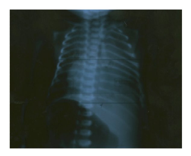
Figure 2. Chest X-ray shows bilateral bronchopneumonia changes of the lungs.

Because of this lung changes and other signs and symptoms, the infant was admitted to the intensive care unit and placed on assisted mechanical ventilation.