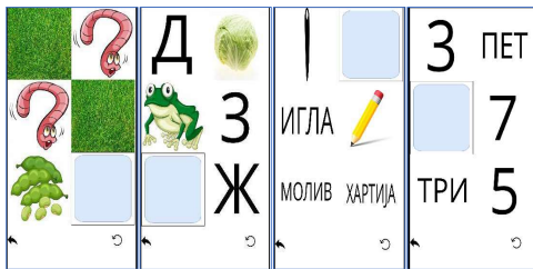
Figure 4. Memory game, intermediate level: coupling equal images, the initial letter with an image, the written name with an image, and numbers with a word.

Source: Mobile application for practicing memory of children with Down syndrome, developed by Davor Trifunov, B.Sc.